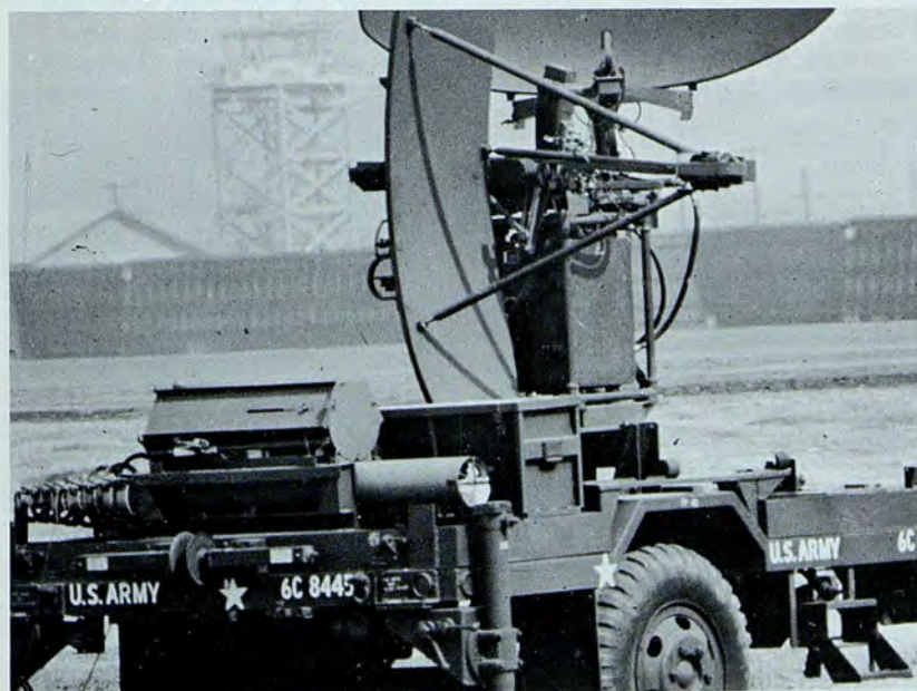
Ground Control Approach radar picks up aircraft and transmits an image to the GCA Specialist's radar scope.