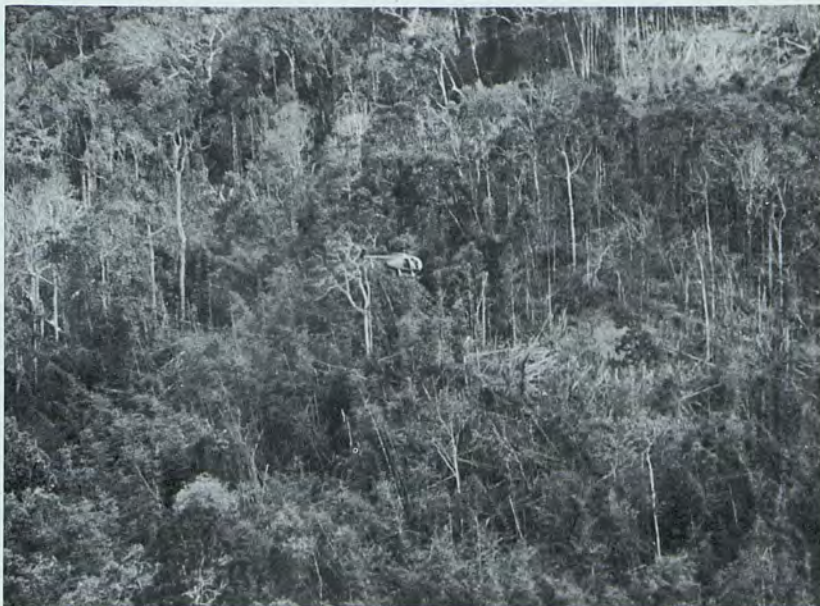
An OH-6A Light Observation Helicopter scouts an area near Ben Het for signs of enemy activity.