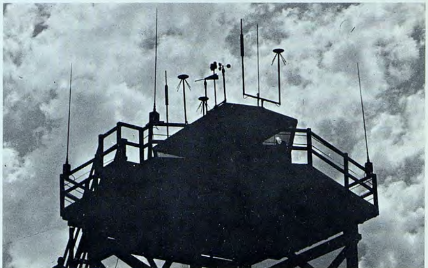
This is the tower in which they work to insure the safety of any and all aircraft in their area.

A lot of people are happy they are. Just ask the man who flies.