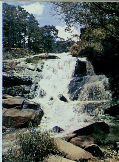
Refreshing waterfall typical of the scenery around Dalat.

Dalat Palace, a large exclusive guest hotel, overlooks the lake and surrounding area of forests,