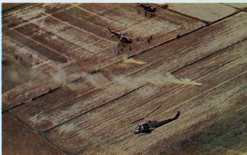
Slicks from the 335th AHC insert troops of the 9th ARVN Division as a UH-1B Huey gunship hovers protectively nearby.

A slick from the 335th AHC noses down as it pulls pitch after inserting an element of the 9th ARVN Division in an LZ near Nui Coto in the IV Corps Tactical Zone.