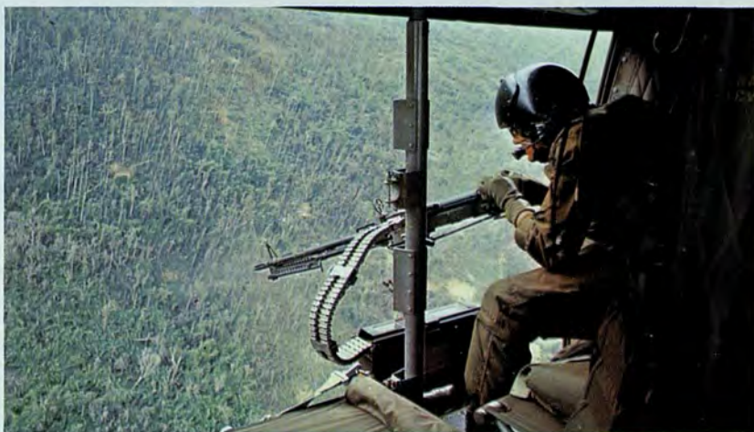
SP5 Jerry Silvey cuts loose a burst