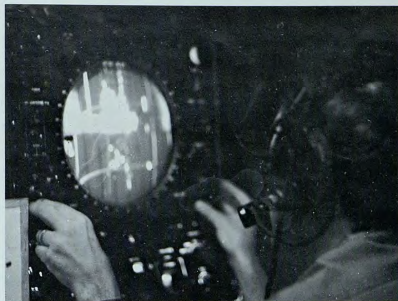
GCA Specialist of the 165th Aviation Group scans his scope observing the flight paths of aircraft in his sector.