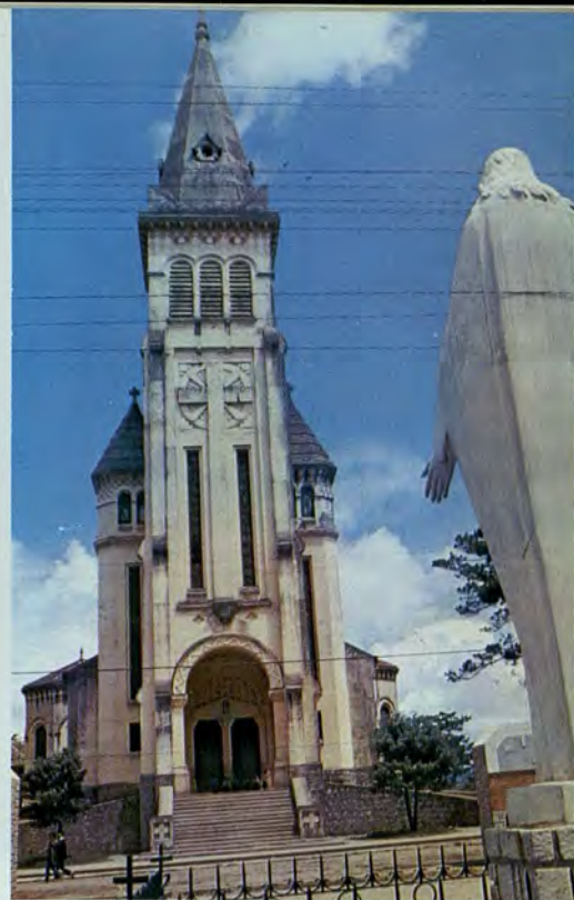
A Catholic church on the edge of the city provides peace and beauty in the midst of a war-torn land.

It has been said that Dalat is one of the best kept secrets in Vietnam. Many servicemen do not realize the beauty of the city and unfortunately, many never get a chance to see it. Dalat remains however, one of the most attractive cities in the Republic of Vietnam.