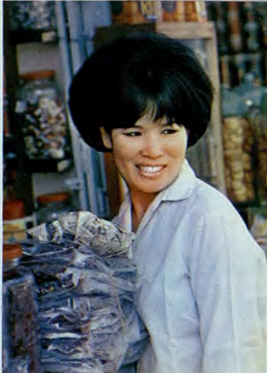
A pretty girl on the streets of Dalat.