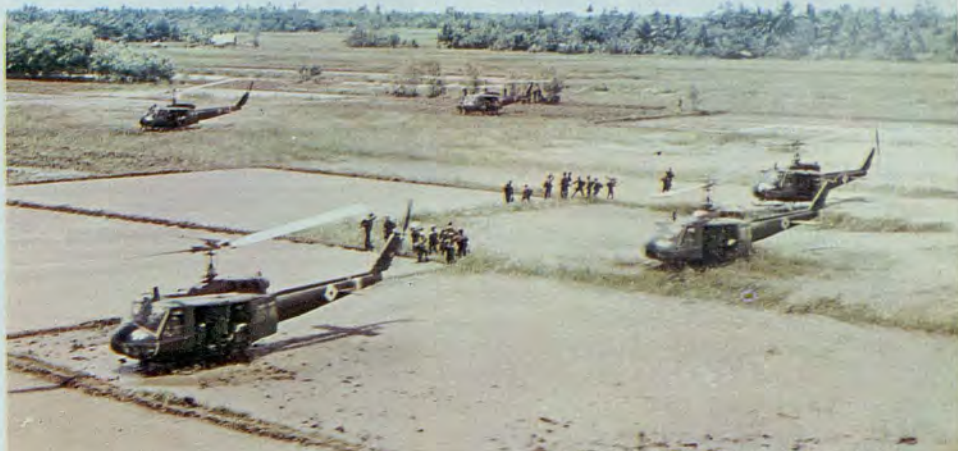
Slicks from the 335th AHC prepare to pull pitch after inserting troops of the 9th ARVN Division in a rice-paddy LZ.

and Alpha team pulled pitch, banked left and directed more fire into the tree line. Bravo Team followed swiftly.