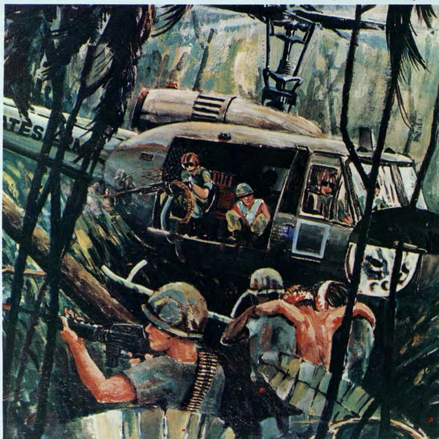
Extraction. SP5 Dan Whitehead.