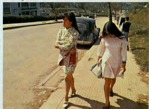
Two pretty college co-eds stroll along the street on their way to class at Dalat University.