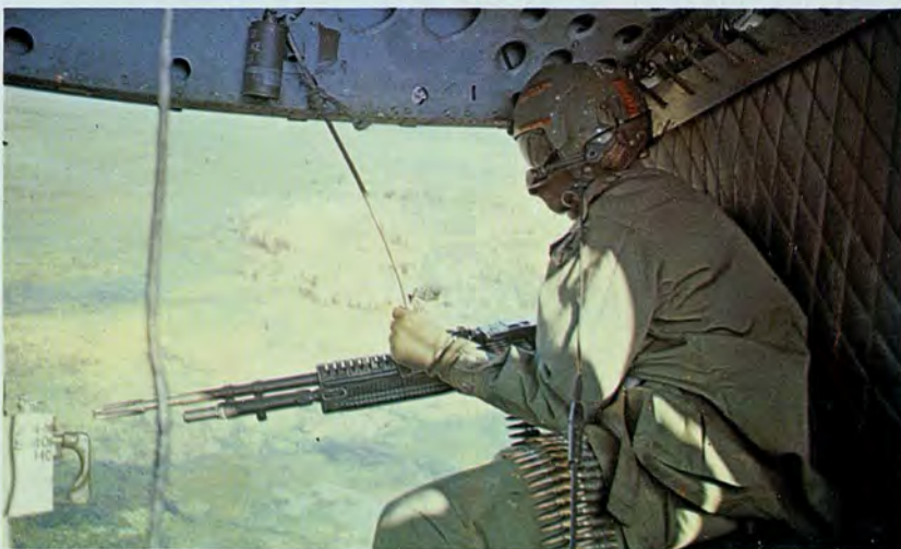
A door gunner uses a "Bungee Cord"