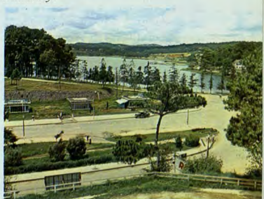
Photo taken from a downtown Dalat hotel overlooking Lake Dalat.