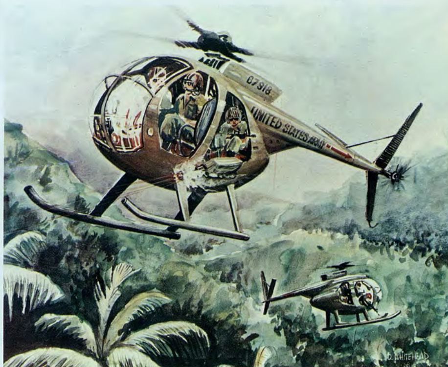
Light Horse Cavalry. SP5 Dan Whitehead.