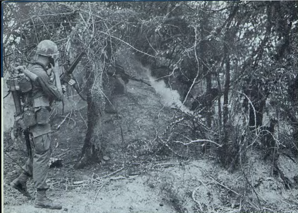
Riflemen from B Troop, 7/17 Air Cavalry Squadron, radio in results after tossing a grenade into an enemy bunker complex killing two NVA soldiers.

general of I Field Force (IFFV), supports the success of the troop as they supported the ARVN, Civilian Irregular Defence Group and 5th Special Forces advisors in the 24th Special Tactical Zone (STZ).