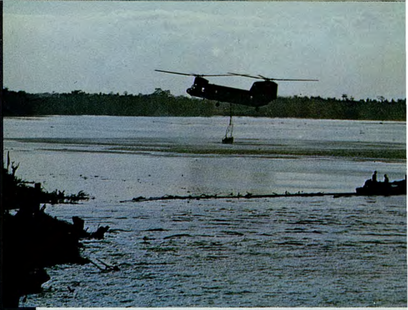
A nearby river is the best water source.

The methods and means for fighting fires continues to progress—it had no where to go but up.