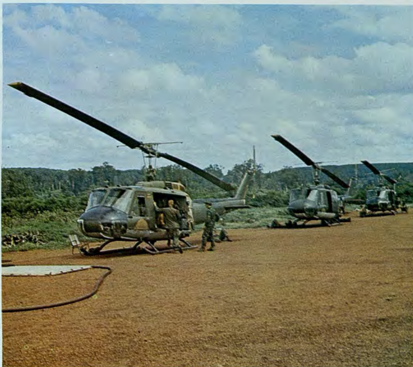
Ships of the 240th AHC await further orders.