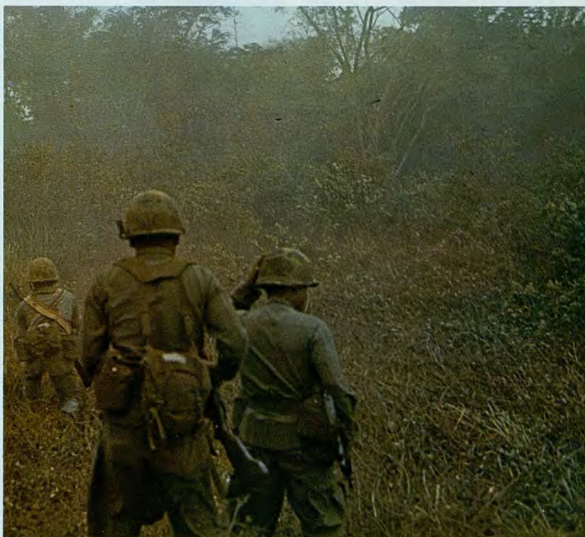
Three Thai LRP's leave chopper on an insertion.