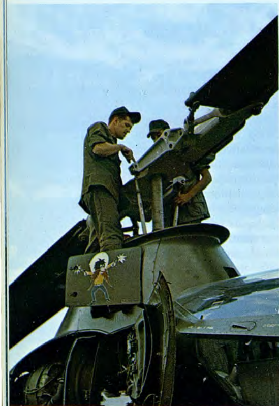
WO Park pre-flights ship with crewchief.

They were the first fully-armed helicopter unit in Vietnam, hence the slogan seen on the 334th's badge, "First With Guns." The armed helicopter was a totally new concept in its first years in the combat theater. The UTT developed tactics and techniques which are