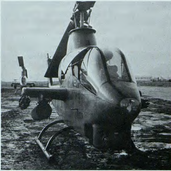
Their "Snakes" are ready as...

now standard procedures throughout the world.