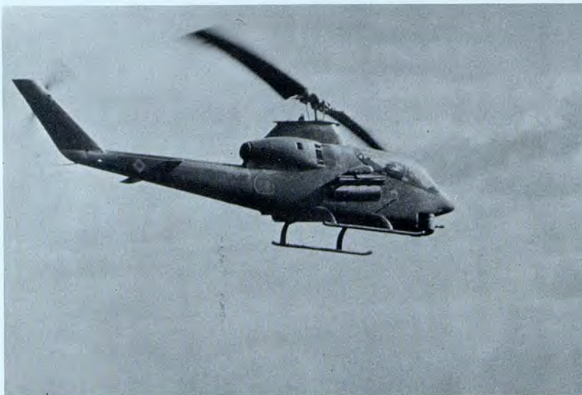
Air cover is provided by 334th Cobras anywhere in III Corps.

onto a five-minute notice when the first ships scramble out.