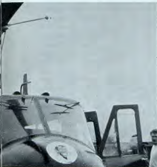
hydraulic dampers checked.

troops into their LZ under the illumination of ROK artillery and the mission completed."