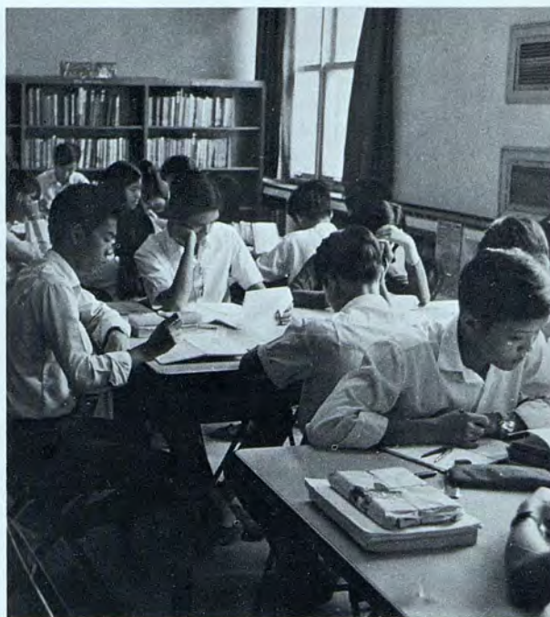
Nearly 15,000 students attend classes taught by the VAA's 165 instructors.

a national photography contest. During the oratorical contest the best presentation from each province is brought to Saigon, and the student competes with his contemporaries at the VAA's auditorium.