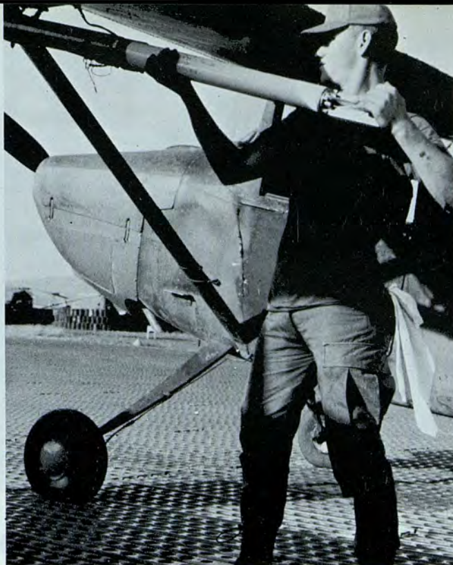
A marking rocket is placed in its tube.

Since its activation in 1965 at Ft. Hood, Tex., the company has received a Valorous Unit Award with a streamer embroidered "Plei