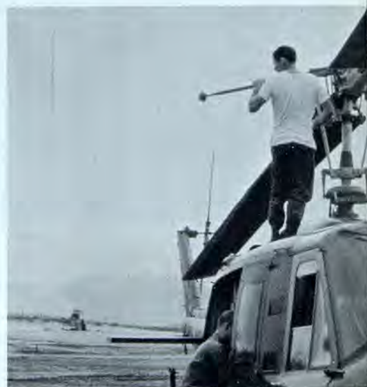
A Devil ship has its

During some of their most recent action, the 134th has taken part in night combat assaults (CA)