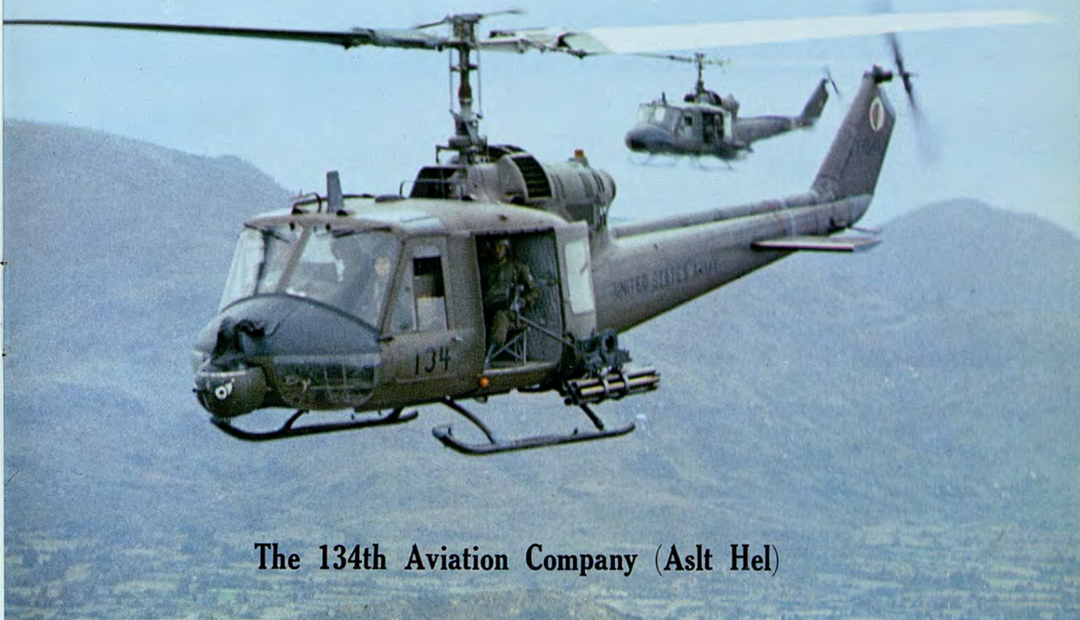
The 134th Aviation Company (Aslt Hel)