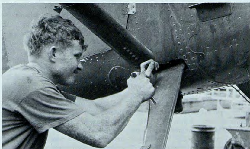
Long hours in the air mean long hours of maintenance.

The enemy must be found before he can be fought. Vietnam's jungles make this a difficult task, but the 219th's Bird Dogs continue to make the job easier by serving as the long range eyes of the infantry and artillery.