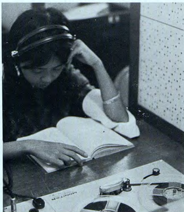
A modern language lab offers both Vietnamese and English lessons.

The VAA also sponsors two annual national contests; a national high school oratorical contest and