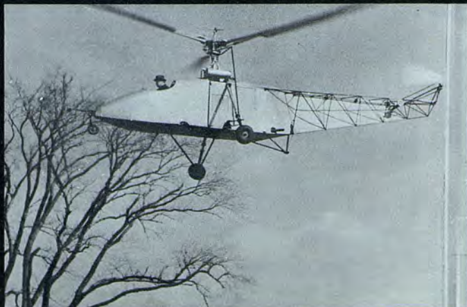
Sikorsky's VS-300 was flying by 1940.