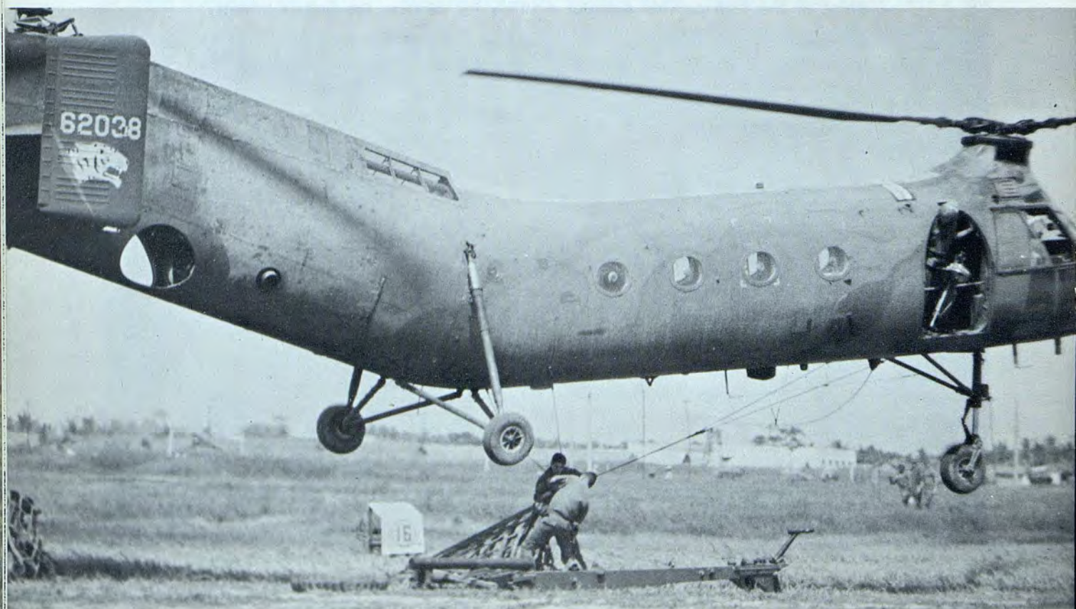
This CH-21 Shawnee of the 1962 Soc Trang Tigers was one of the first aircraft in the Delta.

The gunships are the fast, powerful Cobras, which remain at higher altitudes than the guns of the AHC's do. The low-altitude work is done by the exciting little light observation helicopters which buzz around virtually at the tree tops seeking out the enemy. The LOH platoon for the Cav is nicknamed the Outcasts with "Low