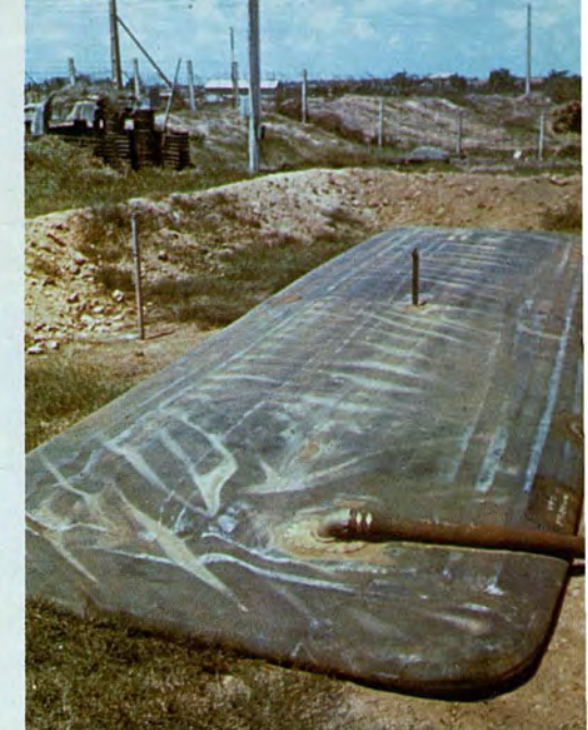
Bladder bags store fuel.

A Class III supply point such as Soc Trang in the Mekong Delta