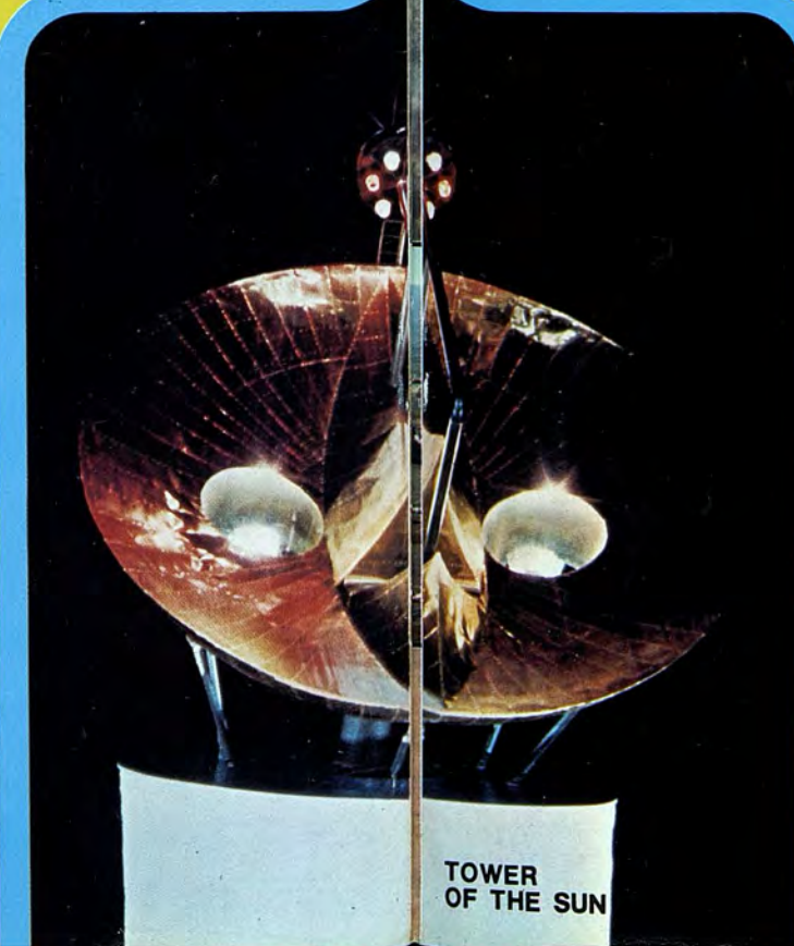
TOWER OF THE SUN