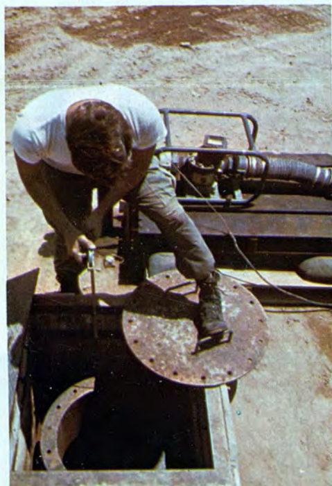
Gauging the tank's fuel supply.