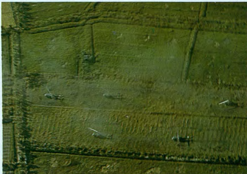
Slicks from the 162nd AHC hit the LZ.

By October of the following year, the newly-created Thirteenth was moved into the Republic and merged with the Delta Aviation