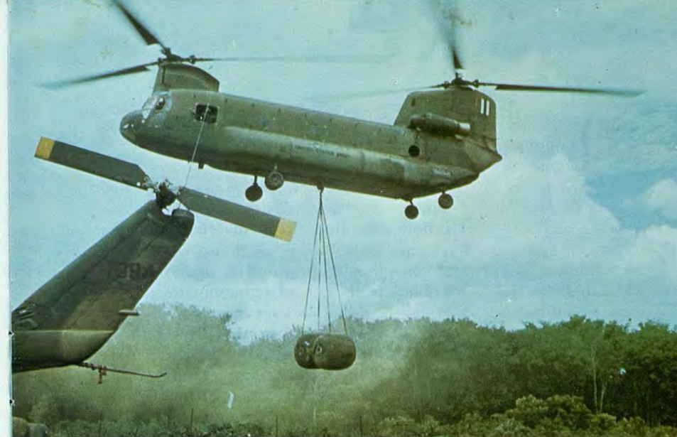
Chinook hauls 500 gallon blivets of fuel to desolate area.

where they are needed. Presently, fuel is shipped to specific supply points throughout South Vietnam by means of air, convoy, or barge. The latter technique is used less often than the other two, but does provide a valuable means for shipping vast quantities of fuel.