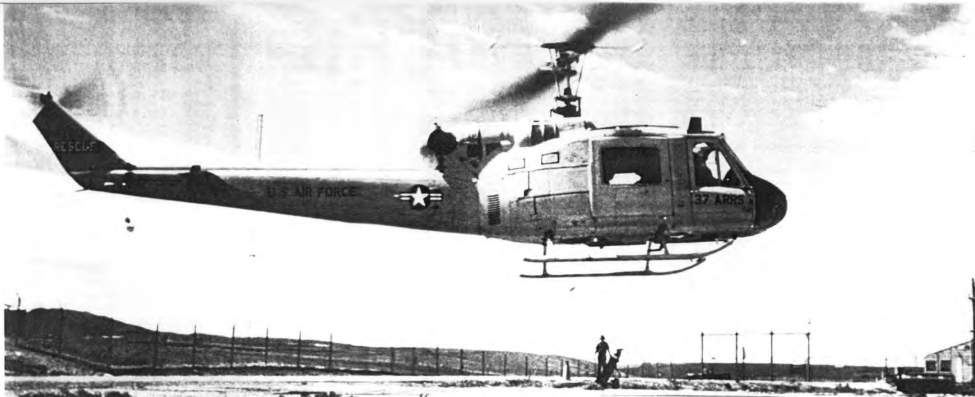
(Above) A TH-1F trainer of the 37th ARRS at Ellsworth AFB during SAC exercise 'Global Shield 79'.