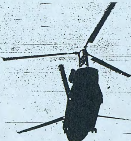
Seconds later the Cobra's heading for home