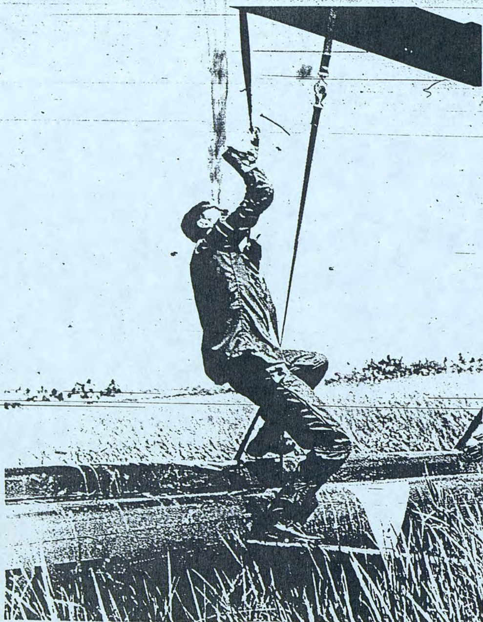
Rigger secures blade to tail boom

Missions such as this save the U.S. millions of dollars by recovering aircraft which otherwise would have been lost or further damaged by enemy action.