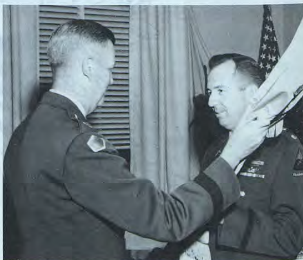
The 7/17th Cav is reactivated

Armor Branch knew they were going to activate the two squadrons so they began positioning critical personnel and equipment at Ft. Knox during the Fall. I arrived in October and by late November it was getting cold and there were too many leaves covering the golf course; so we had to go to work. Most of the Hueys were already at Godman. At that time Ft. Knox was still "locked in the CONUS mentality" but we were a combat unit most likely destined for Vietnam so I wanted to be different. We started wearing subdued insignia and name tags. I wanted a unit patch that would help build esprit de corps like the units in Vietnam.