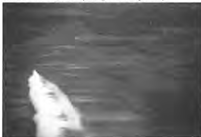
Smokey working out prior to our insertion.

13 Feb 1968 - Well today was the wildest day I have had here yet. Went to LZ this morning south east of Saigon (5 miles). On taking 10 sorties in, we went over line of trees on short final with full suppression (all aircraft firing door guns). I was chalk 8. We set down and grunts started to get off. About that time about 10-15 feet to our left we hear big explosion and all kinds of automatic machine gun fire. We were almost hit with RPG (Rocket Propelled Grenade). A few grunts got hit and ship in back of us shrapnel in tail rotor. Scared the hell out of me. We then took 20 more sorties to same place about 1300. This time we had 2 heavy fire teams (light fire team = 2 gunships, heavy fire team = 3 gunships). That is 6 gunships, and Air Force making an airstrike on LZ as we went in. 1800 extraction, aircraft bogged down in mud and grunts couldn't get to ship. Crew chief jumped out and pulled in some aboard. Air Force jets 50 meters away. Gunships working and smoke screen lifting. Finally got out. Vulture 15 got a grunt with live RPG or M-79 round still in his leg unexploded. Almost flew into Smokey on the way out. VC machine gun tracers going all over. Quite a day but still haven't been hit yet. (Was flying lead with a captain and he got the Distinguished Flying Cross for this mission, I was put in for a Bronze Star but it was turned down? I got out of my seat and assisted the crewchief pulling in a few grunts.)