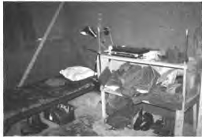
My bunk area at Phouc Vinh - January 1968

22 Jan 1968 - Had a small ride today, will get checked out tomorrow. Things looking up. 175mm still shaking me up when firing. Looked for a watch today. Next time I go to Phu Loi will get one then.