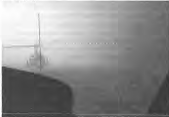
First of many dusty LZs

27 Jan 1968 - Well today we went to Quan Loi, about 15 miles north of Phouc Vinh. Had a CA, and then made two trips to Dion (pronounced Zee On) and back to Quan Loi. Made an extraction which got kind of hairy. Dusty as hell up there. Saw an example letter up on the bulletin board up there (Quan Loi) with Mrs. John Doe, 2611 South Pine St. Napa, Calif. on it. Well nothing else much happened (yet). TET is starting. May get mortared. 9 hours flying.