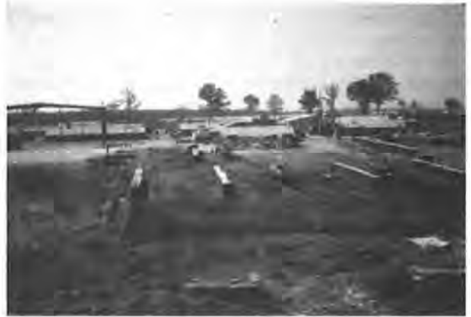
Our revetments at Phouc Vinh. Hanger being built.

1 Feb 1968 - Well had a CA up at Song Be. One of our ships went down. All safe. The ship I had scared the hell out of me. (Fuel gauge, altitude indicator are inoperative.) Went IFR on the way home. Lost flight for 5 minutes. Phu Loi got attacked today. Expect mortar attack tonight. (Had one this morning at 0600). 5 hours flying.