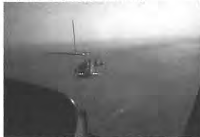
One of my first flights with the 162 nd AHC

24 Jan 1968 - Today went on my first combat assault up to a place called Katum, 3000 meters from the Cambodian border. Didn't get shot at! We then had a defoliation mission (agent orange) about 50 feet at 60 Knots in Charley country, with gunship escort. We were east of Lai Khe in the Iron triangle area, Bo Loi woods. Got off at 1215. About 5 hours flying. Going on test flight tonight. (Didn't go) Got hair cut off today.