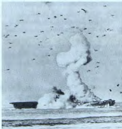
On 14 May 1945, during the Battle of Okinawa, Enterprise (CV 6) was struck by a kamikaze, which blew the No. 1 elevator over 400 feet in the air.