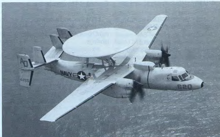
A VAW-120 E-2C Hawkeye in low-level flight over the Atlantic Ocean.

The crew of an NAS Norfolk, Va.-based VAW-120 E-2C Hawkeye successfully coordinated a search and rescue (SAR) effort with an Air Force KC-135 tanker and the NAS Oceana, Va., SAR unit. The crew of the KC-