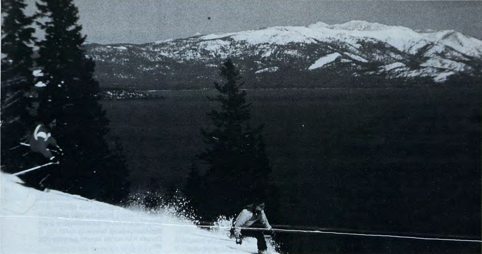
Skiing above Lake Tahoe is a popular winter pastime.