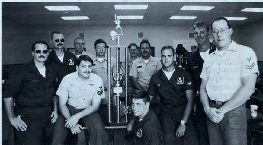
The Jolly Roger softball team snatched this Las Vegas city tournament trophy during the May 1995 USAF Weapons School Det weekend break.