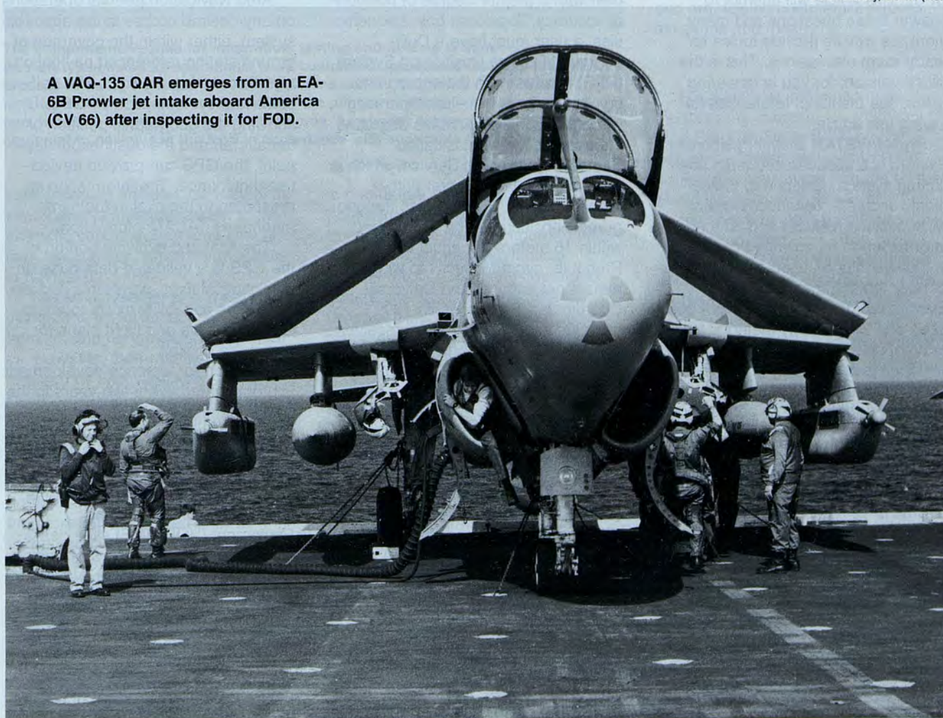
A VAQ-135 QAR emerges from an EA-6B Prowler jet intake aboard America (CV 66) after inspecting it for FOD.