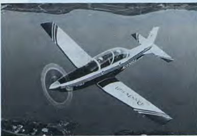
The Beechcraft MkII is the winner of the JPATS competition.