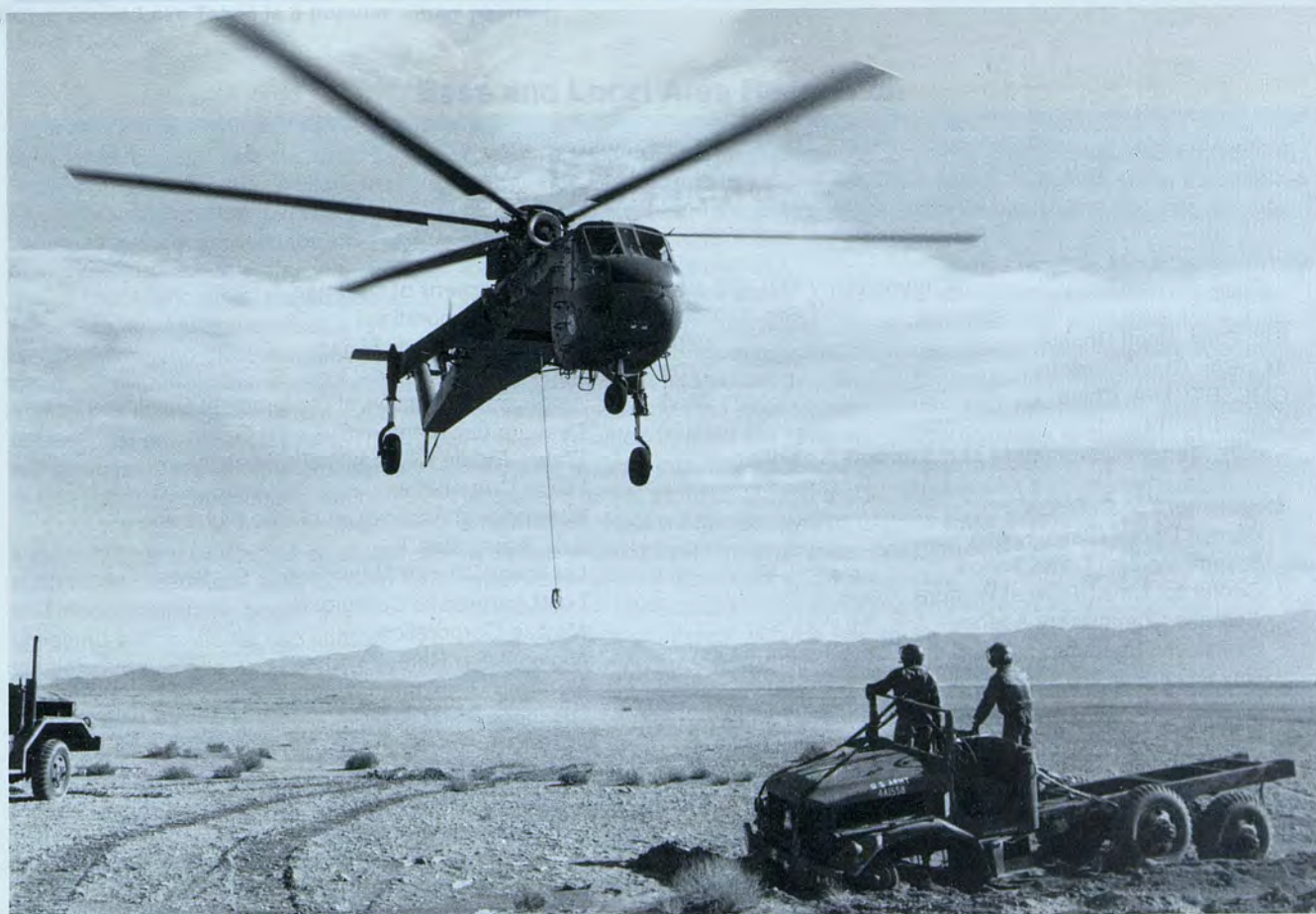
A CH-54 takes part in NAS Fallon range maintenance operations.

By 1996 the Navy Fighter Weapons School (Top Gun), Carrier Airborne Early Warning Weapons School, Fighter Composite Squadron