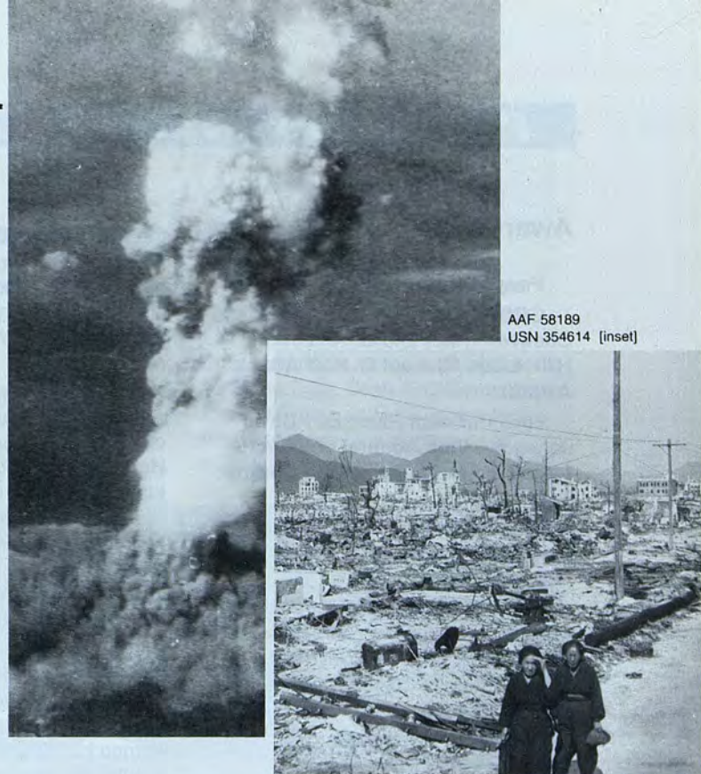
AAF 58189 USN 354614 [inset]

Despite the current debate on the atomic bombing of Hiroshima (seen here) and Nagasaki and the end of the war, there can be no doubt that President Harry S. Truman and U.S. military leaders wanted to use the bomb to end the conflict in the Pacific with a minimum loss of American life. Inset: Although thousands of women and children were among the victims of the atomic devastation, Hiroshima was a military target. It was headquarters for the defense of southern Japan, a principal port for sending men and weapons to Kyushu, and it had a major naval air station and army depot.