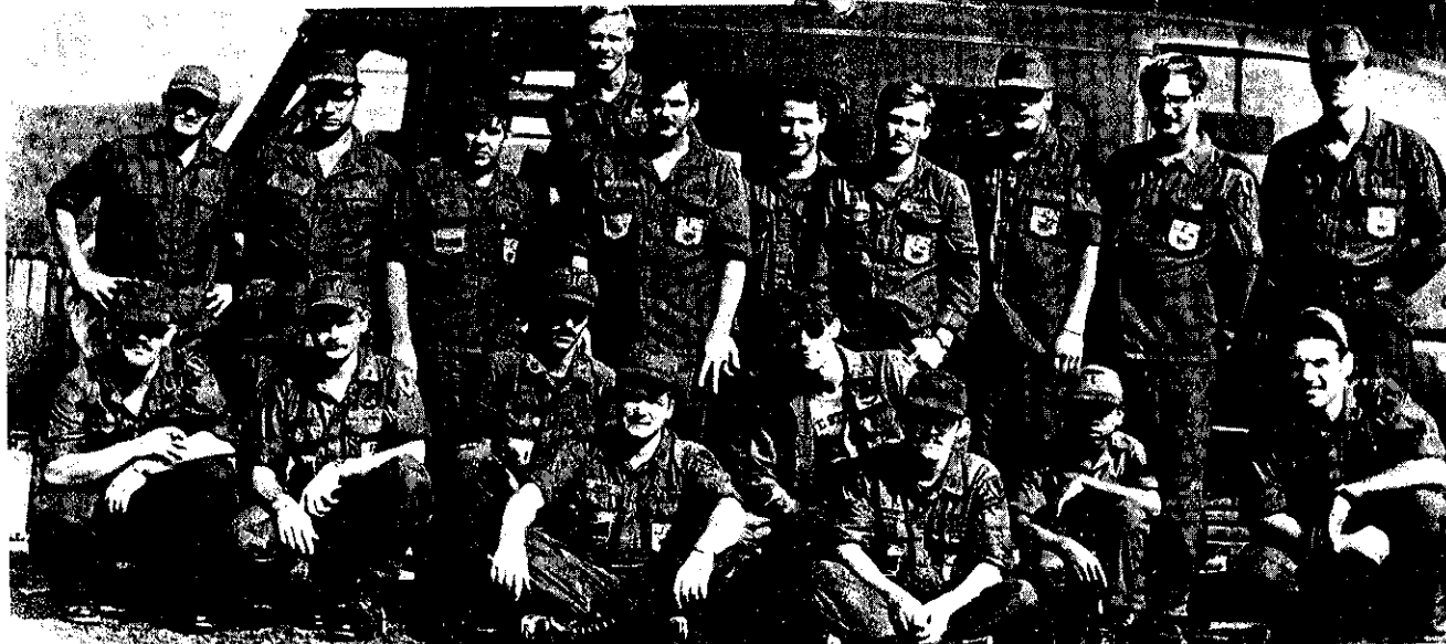
1st Flight Platoon