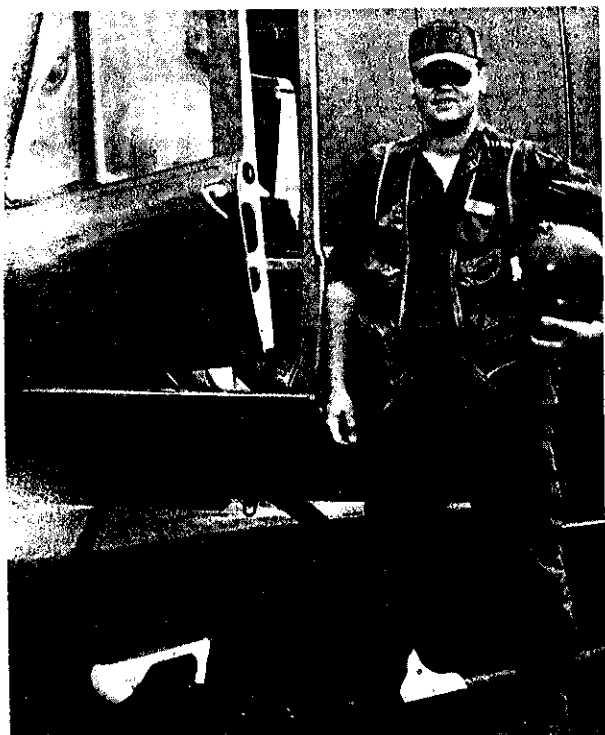
Cobra Garden Snake