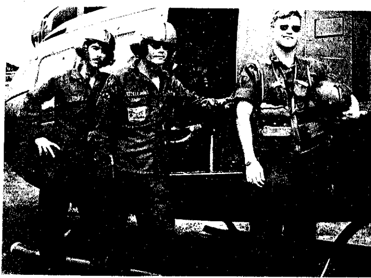
They said it couldn't be done.