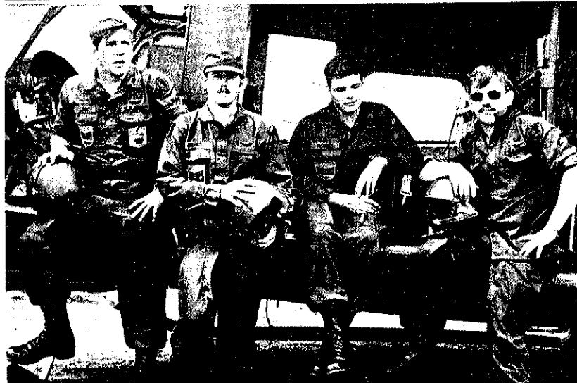
Close your mouth, Link!