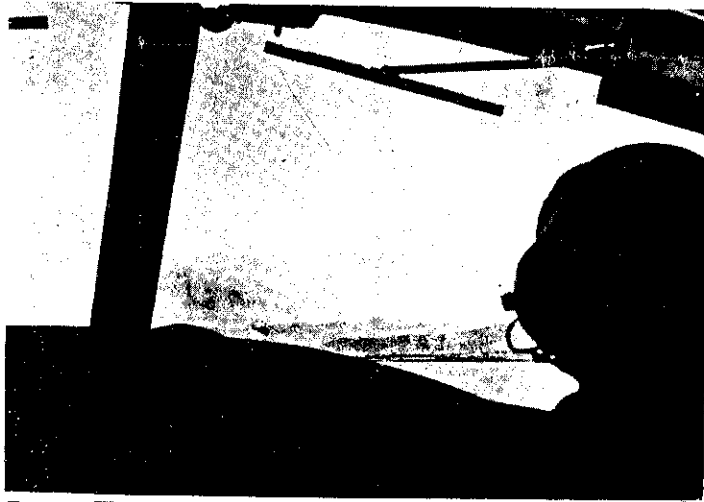
I got him!