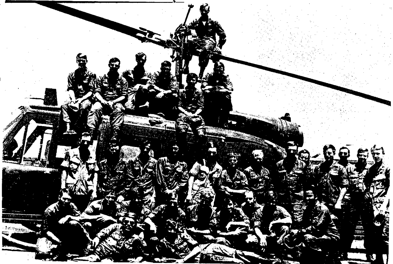
We only pulled 55 pounds!