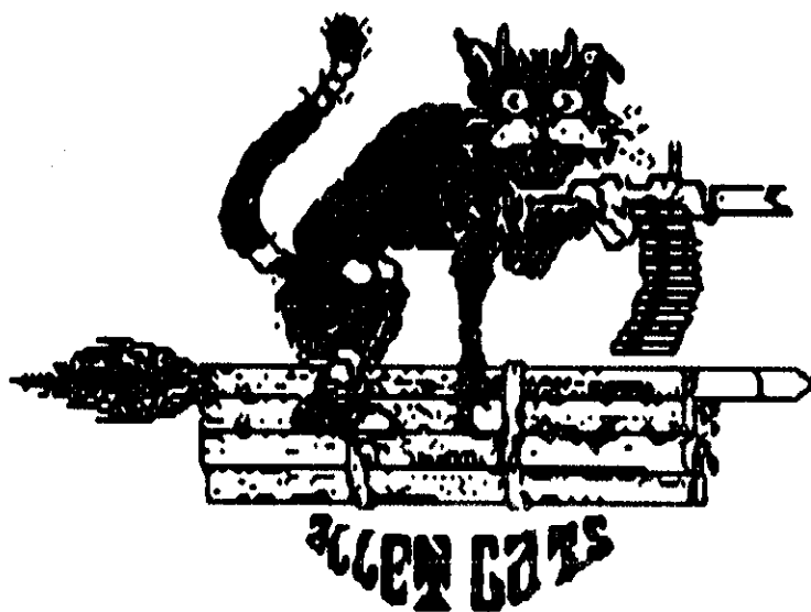
Alleycats Gun Platoon