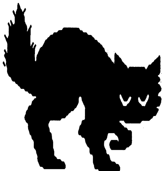
Black Cats Lift Platoons