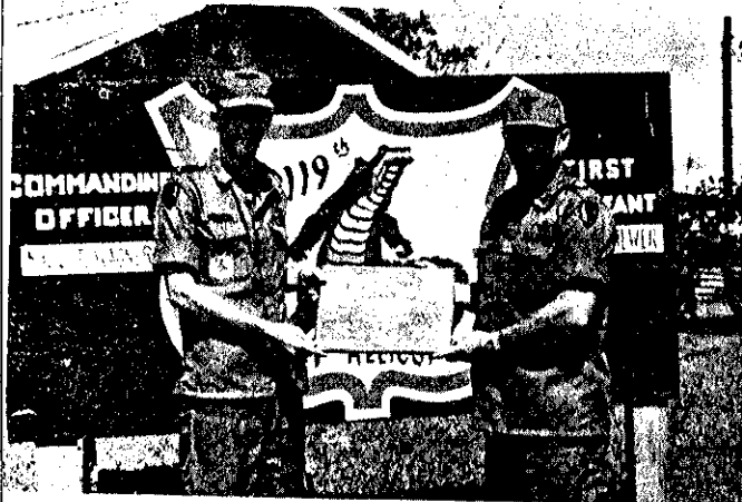
Papa "Gator" gives unit plaque to Dragon Six.