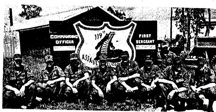
Papa Gator and his little Alligators