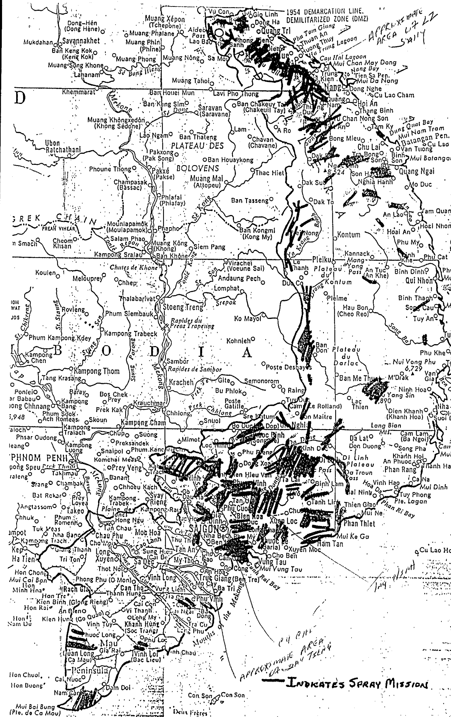
DEFOLIATION MISSIONS 1968