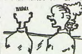
"HE STARTS BRAGGING ABOUT HIS COOKING SKILL, I CAN WIN WITH THE NEXT BALL!"