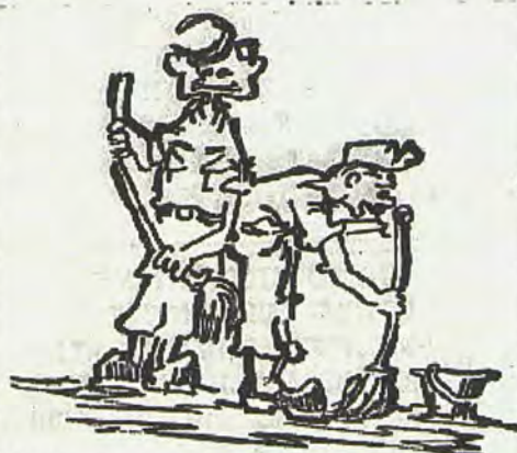
"My RECONTER WAS QUITE IN GAINING ALOT OF EXPERIENCE!"