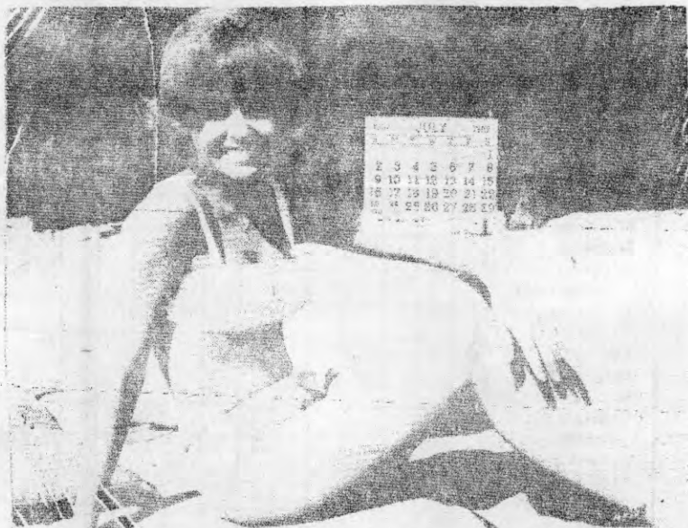
RELAXING TIME—Hollywood's Deborah Walley has the right idea for the summer—just taking it easy on a sunny beach.