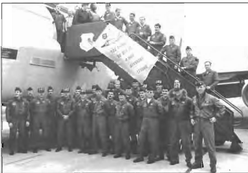
Crew members of the 6916th ESS, Hellenikon AB, Greece following the unit's milestone 4,000th RC-135 mission on 17 October 1986.

Conversion of ESC and JEWIC civilian employees from competitive to the excepted service under the new Civilian Intelligence Personnel Management System (CIPMS) took