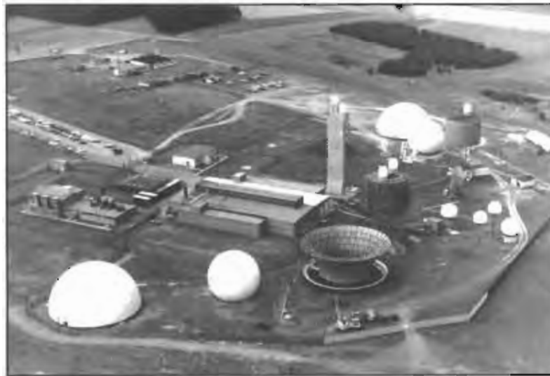
Operations site of the 6915 SG, Hof, Germany.