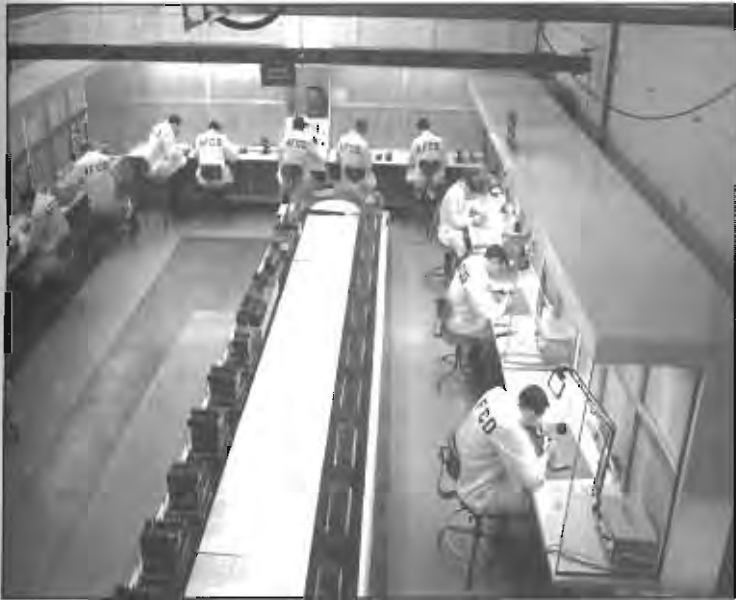
Personnel assigned to USAFSS' Air Force Cryptologic Depot at Kelly AFB perform maintenance on equipment--circa 1965.

The Iron Horse system was put into operation at Da Nang AB (6924 SS) and Monkey Mountain, South Vietnam.