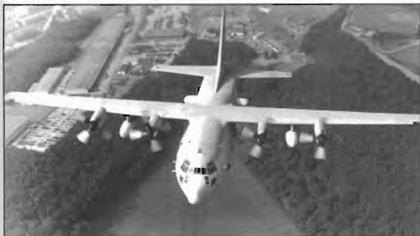
The 6919th ESS, Sembach, Air Base, Germany, began supporting EC-130 Compass Call operations in late 1986.

assignments of women to Red Horse and mobile aerial port squadrons effective 8 June 1988. In addition, the following aircraft were opened for the assignment of women effective 1 July 1988: TR-1, U-2, TU-2, C-29 (flight check), and all EC-130 missions.