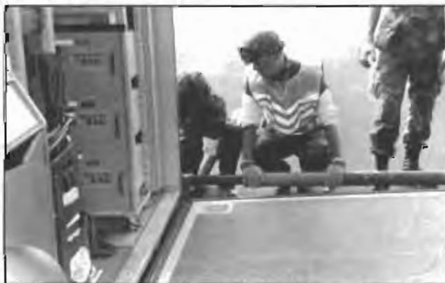
Members of ESC's 6948th ESS assemble the floor brace of a Comfy Shield Hut at Border Star-85, March 1985.

Air Force Secretary Aldridge made a July 1968 announcement that changed the combat exclusion policy for women in the Air Force. The revised policy opened