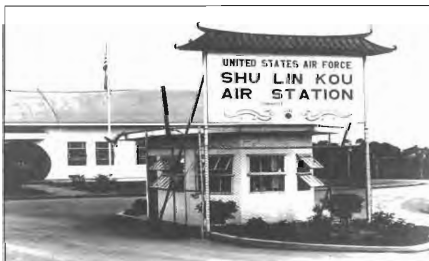
The main gate of USAFSS' 6987th Security Squadron at Shu Lin Kou, AS, Taiwan in 1965.

The first three Combat Apple RC-135 aircraft arrived at Kadena AB, on 10 September 1967, followed by the remaining