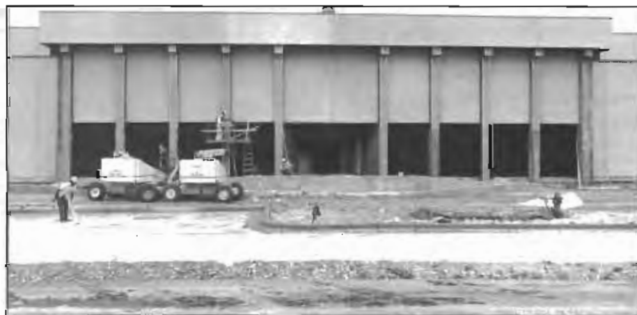
Construction on building 2007, January 1986.

The 25th of May 1990 saw the 6903 ESG and Detachment 2, 9th Strategic Reconnaissance Wing achieve a milestone when a U-2R Olympic Game sortie flew its 5,000th mission.