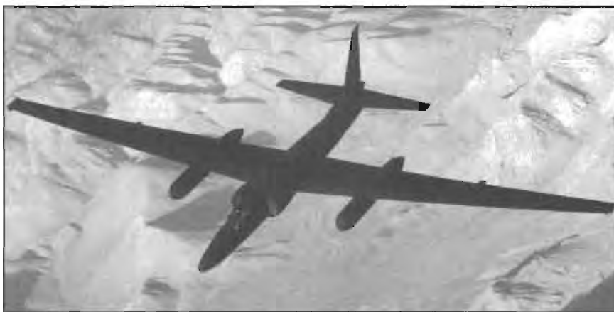
The 6952nd ESS, RAF Alconbury, England began supporting TR-1 operations in 1983.

USAF advised Air Force personnel that PCS/TDY (temporary duty) travel from and to the CONUS would be by MAC contract and military organic flights, routed through Rhein Main AB, Germany, with travel to and from Greece via military organic flights. These restrictions affected personnel movements because of the time required to complete travel—a minimum of three days, more if assigned to Iraklion; and an overnight stay in Athens if traveling to Iraklion and Frankfurt. The addition of a direct flight from Rhein Main AB, Germany, to Hellenikon AB, Greece, helped some travelers, but not all.