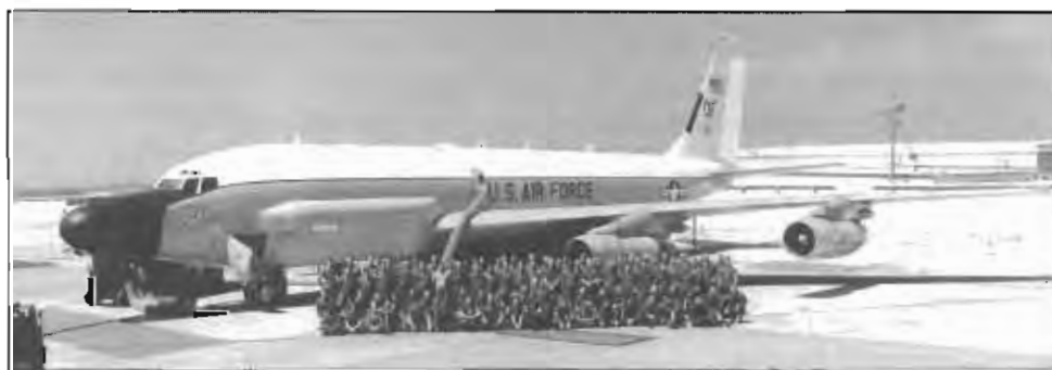
Members of AFIC's 6990th ESS, Kadena AB, Japan, pose with an RC-135 Rivet Joint Aircraft--summer 1992.

More than 50 AIA personnel participated in supporting Coalition Green Flag 97-3 conducted during February and March 1997 at Nellis AFB, NV. The AIA supported RC-135 RJ and EC-130 Compass Call operations, conducted an Electronic Systems Security Assessment and performed other vital information operations functions. The AIA participation tested successfully the Agency's ability to embed with the air campaign planning element and function as part of an integrated team at the operational level of war.