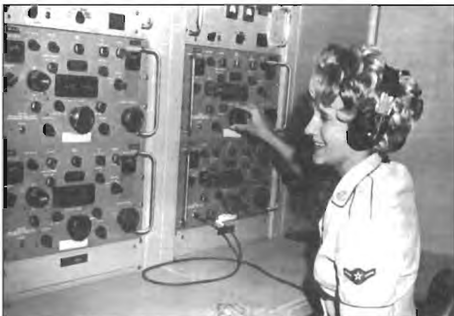
A voice processing specialist works with a receiver at a USAFSS unit--early 1970s.

In the face of constant reductions, the only solution for USAFSS was to find ways to do the job better. The Command's Rivet Joint modernization proposal, approved by the Secretary of Defense on 29 July 1974, represented one approach toward improved operations. It was aimed at replacing the obsolete equipment in the 12-aircraft Rivet