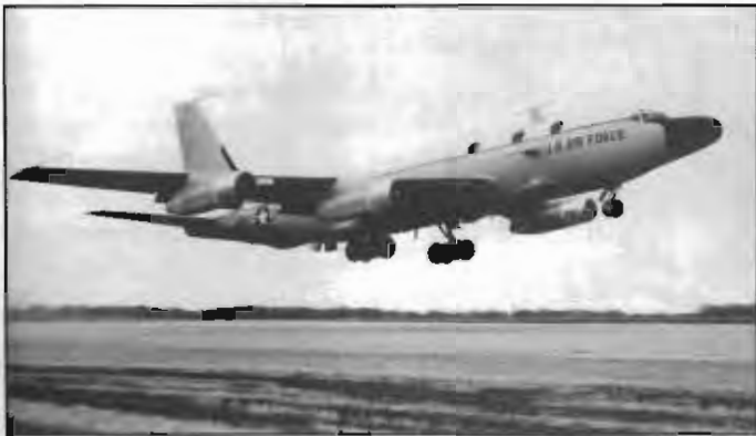
A Cobra Ball RC-135 aircraft takes off. Two ESC crewmen were killed in the crash of a Cobra Ball at Shemya, Air Force Station, Alaska, in 1981.

USAFSS radio operator. He was killed in March 1967 when the EC-47 aircraft he was flying in from Nha Trang AB, Vietnam, was shot down by enemy fire. He headed a crew of three USAFSS operators assigned to Detachment 1, 6994th SS, when his aircraft was shot down and all crew members were killed.