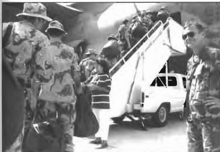
August 1990--members of the 6948th ESS deploy to Saudi Arabia in support of DESERT SHIELD.

On 20 December 1993, the Operations Support Center, AIA's single point of contact for time sensitive intelligence, officially opened.