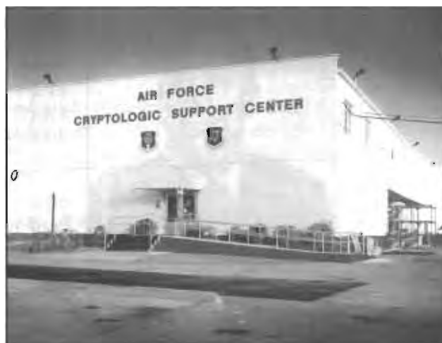
The Air Force Cryptologic Support Depot Force was redesignated the Air Force Cryptologic Support Center on 1 February 1980.

The ESC Hall of Honor, located in Ardisana Hall was formally dedicated on 9 April 1983 in conjunction with HQ ESC National Prisoner of War (POW)/Missing in Action (MIA) observance. Major General Doyle E. Larson delivered the welcoming remarks and former USAFSS Commander, Major General (Ret) Carl W. Stapleton, presented the keynote address.