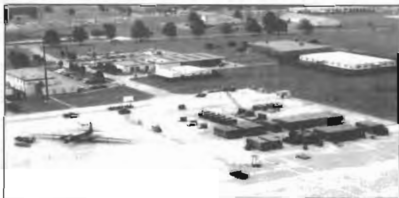
The CARS of AIA's 10 IS beside a U-2 on the Langley AB flightline--1995.