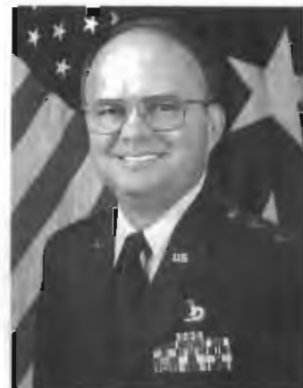
Major General Michael V. Hayden commanded the AIA, January 1996-September 1997

On 2 January 1997, the AIA Commander, Major General Michael V. Hayden, announced implementation of "Global Engagement," the new direction for Air Force operations introduced earlier by Secretary of the Air Force, Dr. Sheila Widnall. Under this program the Air Force would pursue six core competencies. The AIA's responsibility included the information superiority core competency.