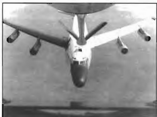
ESC personnel from several units began supporting DESERT SHIELD Operations in early August 1990. An RC-135 Rivet Joint refuels over Saudi Arabia. ESC provided invaluable support on the ground and in the air during Operation DESERT STORM.

In March 1996, HQ AIA learned it had earned its fourth Air Force Organizational Excellence Award for exceptionally meritorious service, covering the period 1 October 1993 through 30 September 1995 for orchestrating the largest restructure of Air Force intelligence since 1947.