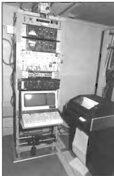
Interior of Comfy Shield "I-Hut" of the 6948th ESS.

In August 1986, the 6990th ESG moved its operations function from the Army facility at Torii Station to Kadena AB, Okinawa. By 1 September 1986 it was operating in the new facility. This move brought the unit's operations and logistics functions together at one central location on Kadena AB. The completion of this relocation project, which began in February 1985, brought to a close more than sixteen years of Army service and support to the 6990th ESG.