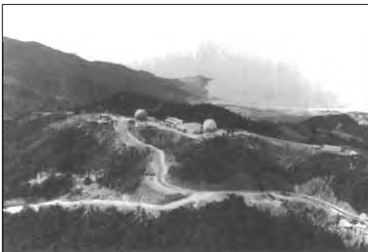
Operations site of the 6924 SS, Da Nang, South Vietnam in 1966.

On 30 June 1968, the USAFSS had 27,365 personnel authorized — 1,481 officers, 23,350 enlisted, and 2,534 civilians.