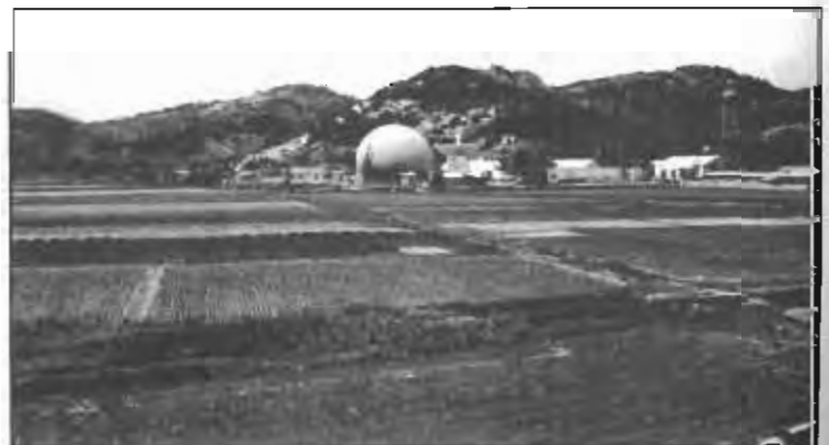
Detachment 3, 6994 SS, Nakhon Phanom, Thailand. The unit was inactivated in November 1972.

The command's European Airborne Reconnaissance Program unit, the 6916th SS, moved from Rhein Main AB, Germany, to Athens, Greece, on 30 June 1973.