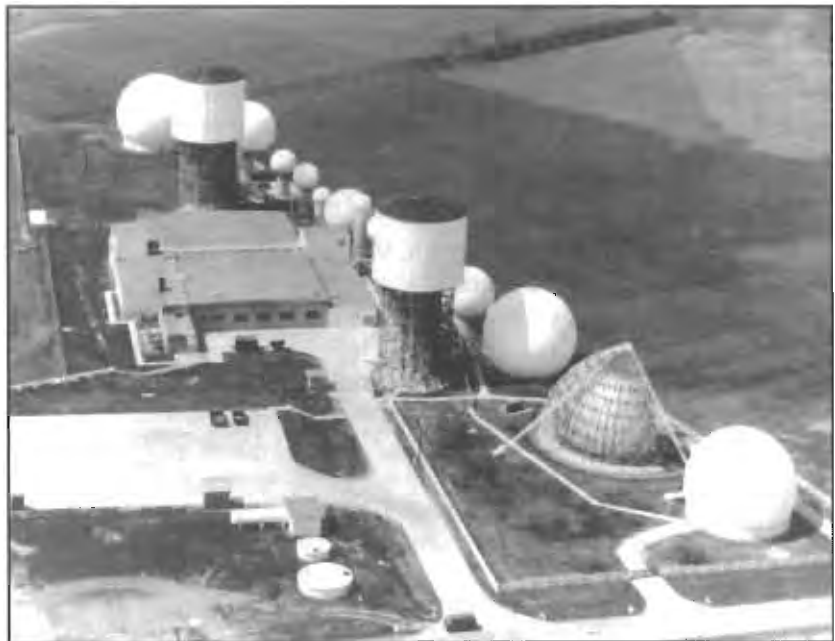
Antenna array of the 6932 SG, Samsun, Turkey--1964.

On 16 January 1967, AFSCC established a 24-hour/7-day per week function to provide direct support to any agency needing information. This data base was the culmination of several years of developmental effort by the Center. It proved increasingly valuable in permitting rapid response to complex queries for technical and intelligence data.