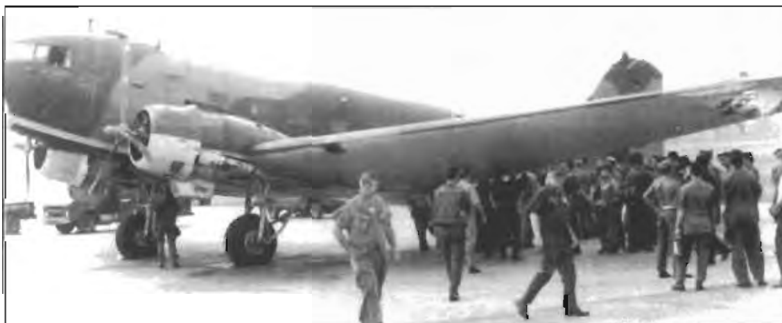
A combat damaged EC-47P of the 6994 SS after recovering at Tan Son Nhut AB, South Vietnam in 1973.

On 16 August 1974, Greek protesters penetrated the base perimeter at Iraklion AS, Crete (6931 SG) inflicting considerable damage to U.S. property located near the station's perimeter fence.