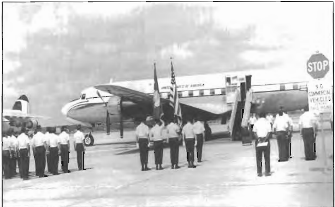
Ceremonies marking the inactivation of USAFSS' flight operations--Kelly AFB, TX, 24 June 1975.

The impact of the Thailand, Taiwan, and Turkey reductions was partially offset by a reallocation of tasks and