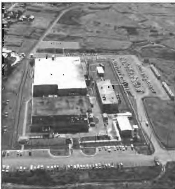
Torii Station home of the 6990th ESG's operations and logistics functions until 1986.

place on 1 July 1989. Later, on 15 October 1989, the General Manager (GM) force converted to the General Schedule (GS) system.