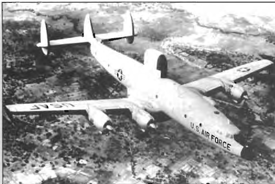
An EC-121 College Eye in flight. USAFSS personnel served aboard the aircraft in the late 1960s during operations in Vietnam providing vital threat warning data to US aircrews.