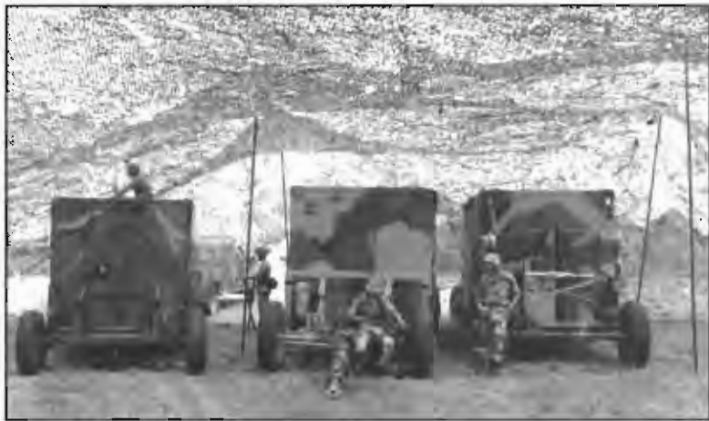
Comfy Shield huts from the 6948th ESS under a camouflage canopy during an exercise--1987.