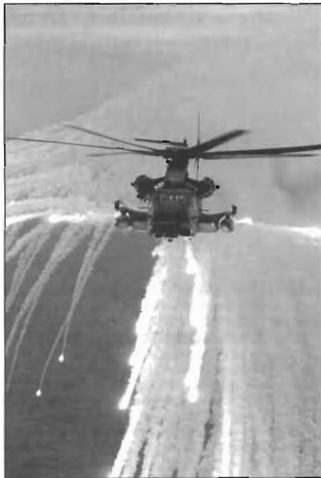
Personnel from AIA work closely with Air Force Special Operations Command serving as Direct Support Operators aboard several aircraft, including the MH-53J Pave Low III.

On 17 March 1998, after one year of operation, the 820th Security Forces Group (SFG) claimed a busy first year. Its first real-world action came in support of Bright Star and Air Expeditionary Force V at Sheikh Isa AB, Bahrain. Embedded AIA assets in the 820th SFG provided threat assessments and aided in the development of the Force Protection Plan.