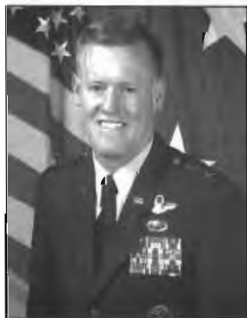
Major General Bruce A. Wright AIA Commander from January 2000-February 2002.

The NAIC, on 16 August 2000, held a dedication ceremony for its MiG-29UB Fulcrum B aircraft. The aircraft on display was one of 21 fighter aircraft the United States purchased from the Republic of Moldova in October 1999.