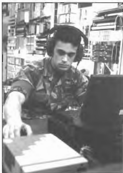
By the mid-1990s, Communications Security Monitoring gave way to full-fledged multi-mode Electronic Security Systems Assessments (ESSA) operations. A member of AIA's 68 IS, Brooks AFB, TX, conducts ESSA operations--circa 1994.

On 1 April 1998, Det 4, 67th IG, moved to HQ Air Mobility Command (AMC), Scott AFB, IL. The detachment became the newest weapon in the Air Force information operations arsenal. Since activation, effective August 1997, the detachment has used Information Operations (IO) to exploit the vulnerabilities of adversaries while building a protective wall around AMC communications and information systems.