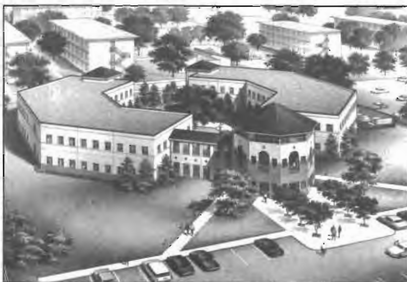
Artist's concept of the new 67th Intelligence Wing Headquarters Building on Security Hill at Kelly AFB. The structure was completed in 1998.

Ceremonies were held on 20 November 2000 to commemorate the 303rd IS' 50th anniversary. After the