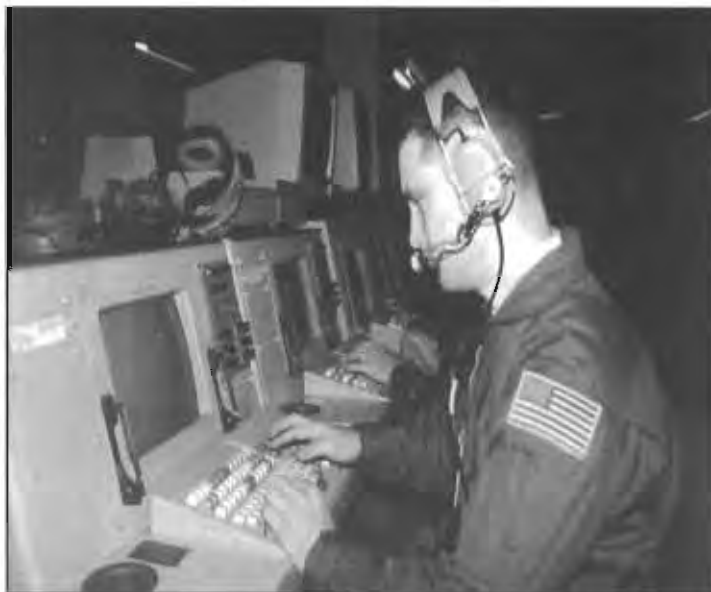
The AIA personnel also support airborne operations on the ground. Here a member of the 488 IS, RAF Mildenhall, England, transcribes information gathered during a Rivet Joint mission.