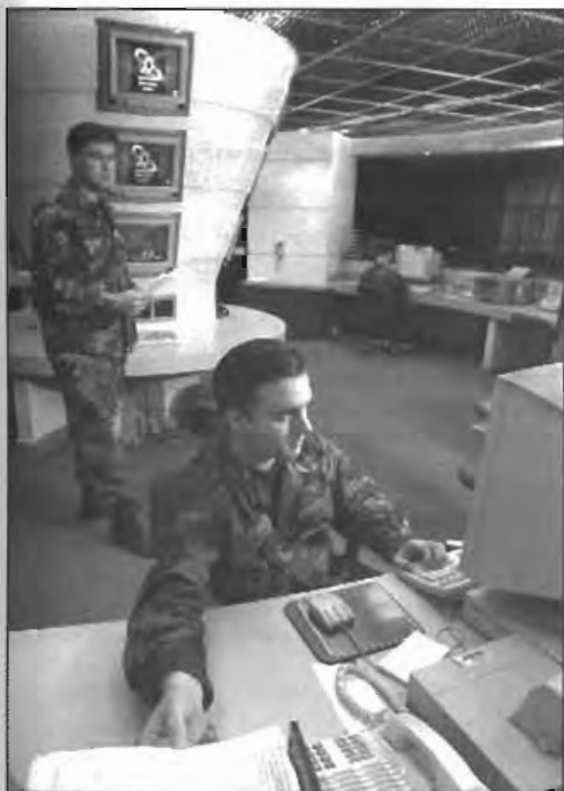
Inside the Agency's Information Operations Center (IOC), at Kelly AFB, TX.

In 2002, Black Demon, a multi-command exercise designed to enhance the Air Force's computer network defense capability, ended after two weeks of extensive exercise play. The exercise validated the effectiveness of network defense tactics against worldwide attack.