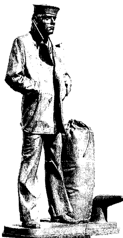
The Lone Sailor® statue at the U.S. Navy Memorial, Washington, D.C.

The U. S. Navy Memorial in Washington now boasts a total of 216-thousand records in its Navy Memorial Log, the high-tech, interactive video record of active duty sailors, retired and former bluejackets, living or dead. The 216-thousand are a bare ripple in the bounding waves of 11-million ex-sailors eligible for enrollment, so the Navy Memorial Foundation is searching for more sailors or their relatives or descendants to tell them about the Navy Memorial Log.