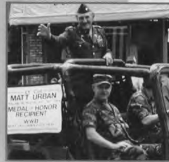
Lt. Col. Matt Urban, Medal of Honor recipient.

National Flag Celebration Inc. was founded in July 1989, following a decision by the U.S. Supreme Court's edict that "to burn, mutilate, damage, walk upon, deface or disgrace our beloved flag in any manner was not unlawful and it was without penalty." Needless to say that decision enraged mil-