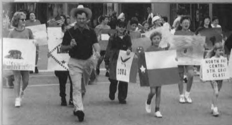
Teachers and Fifth graders from North Knox Central Elementary show posters of the fifty states, during 1993 Flag Celebration Parade in Vincennes, Indiana.

Some would say the flag is just a piece of cloth: true, but much more are the ideals that this beautiful emblem