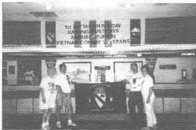
Reunion Hosts at Hotel Lobby