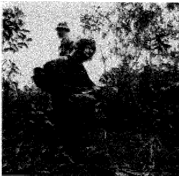
MIA And On Patrol