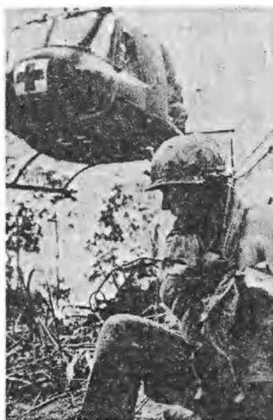
A 173rd Sky Trooper awaits a dust-off chopper on Hill 875, near Dak To.