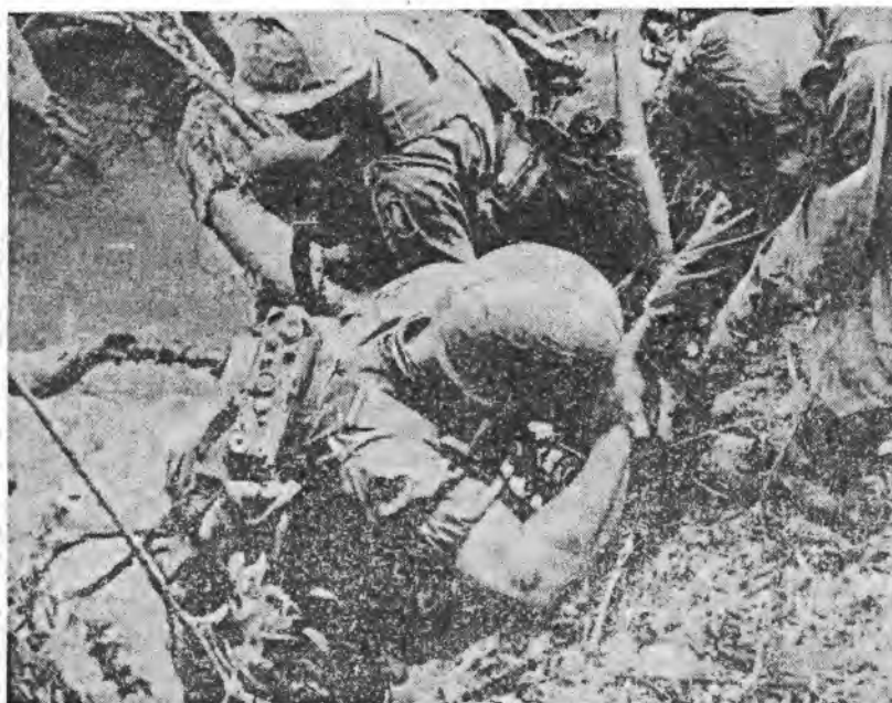
PARATROOPERS FIND ROUGH GOING DURING OPERATION NEAR PLEIKU.