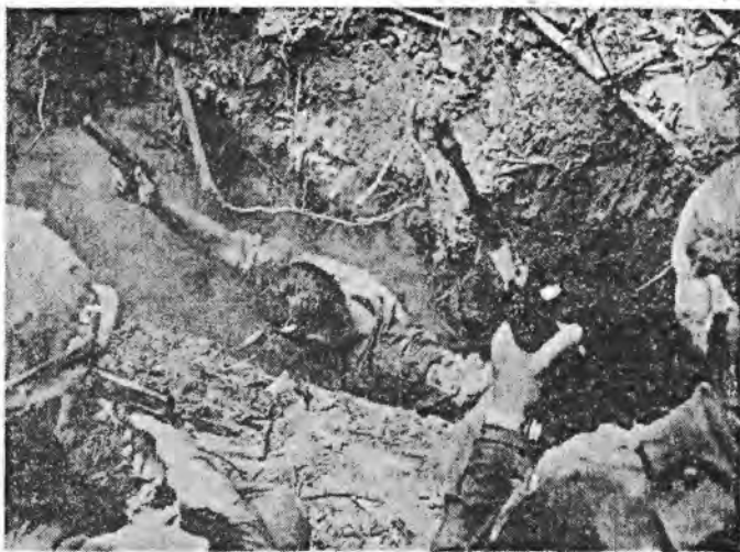
A COMBAT ASSAULT (LEFT) NEAR PLEIKU IN OPERATION GREELY AND CHECKING OUT A TUNNEL COMPLEX (RIGHT) IN OPERATION JUNCTION CITY.