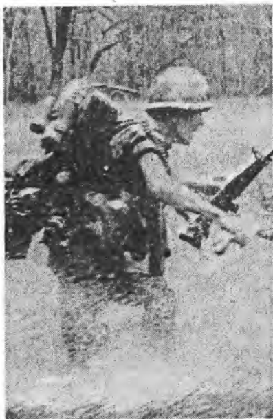
A 173rd Airborne Brigade trooper moves during Operation Bolling near Tuy Hoa.