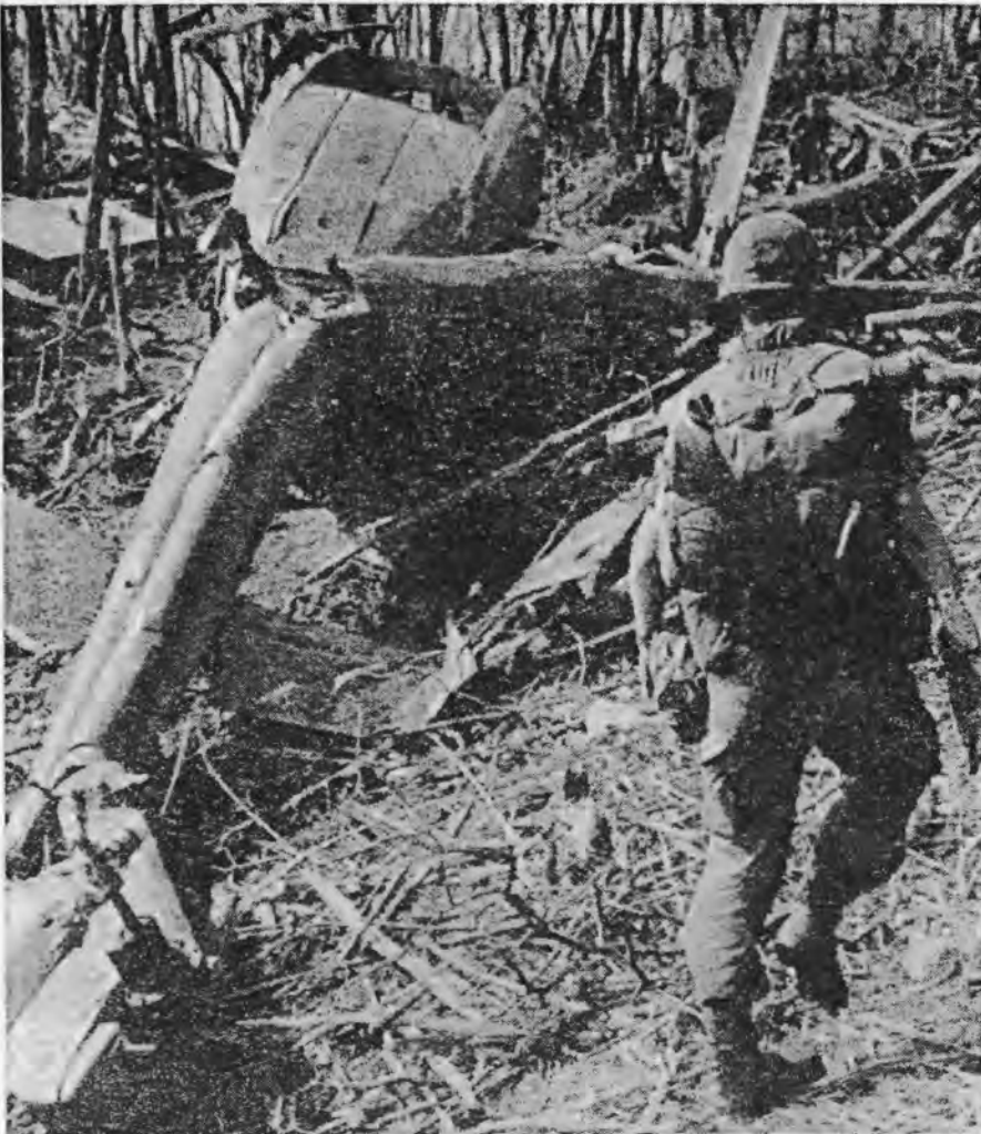
HELICOPTER WAS DOWNED BY NORTH VIETNAMESE AS 1ST AIR CAV. DIV. SWEEPED INTO A SHAU.