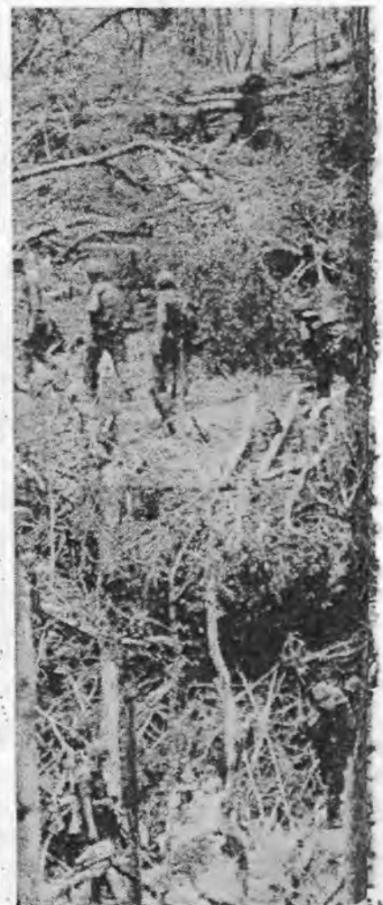
CAVALRYMEN TWIST THROUGH JUNGLE HUN