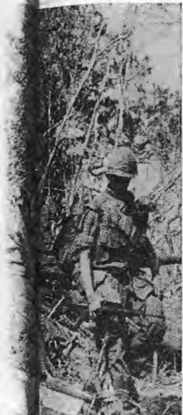
1000-HOUR OFFENSIVE GETS UNDER WAY.