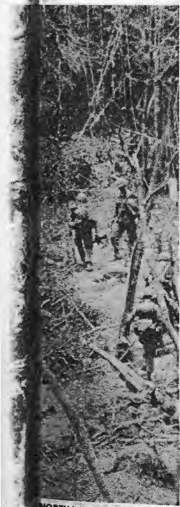
U.S. PATROL MOVES SLOWLY UP NORTH VIETNAMESE-BUILT ROAD IN NORTHERN PART OF A SHAU VALLEY.