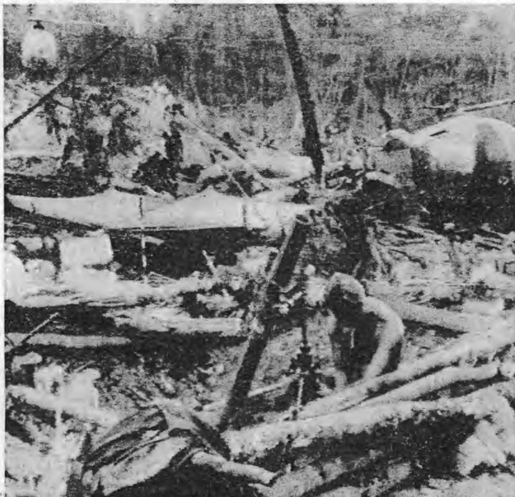
TROOPS SET UP POSITION NEAR DOWNED HELICOPTER, ONE OF 30 LOST DURING BIG ALLIED ATTACK.