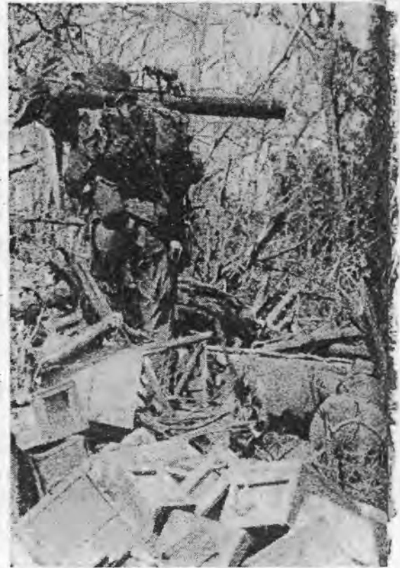
CAVALRYMEN MOVE FROM LANDING ZONE AS 20,000-NUM