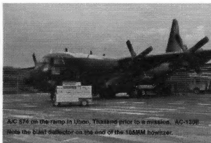
AC 574 on the ramp in Udon, Thailand prior to a mission. AC-130E Note the blast deflector on the end of the 105MM howitzer.