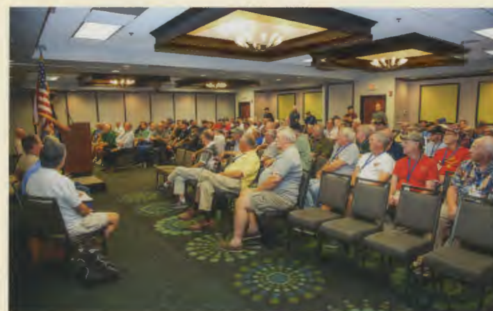
Membership meeting was well attended by reunion attendees.