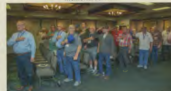
Members recite Pledge of Allegiance at Saturday meeting.