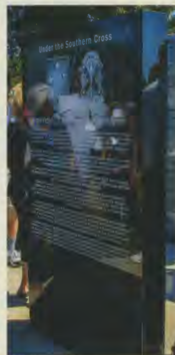
Americal Monument Ft. Sill, Oklahoma.