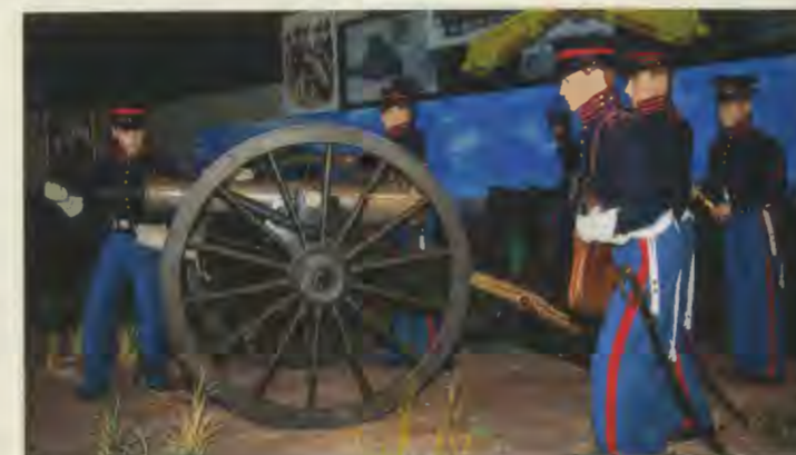
Display at Ft. Sill Artillery Museum.