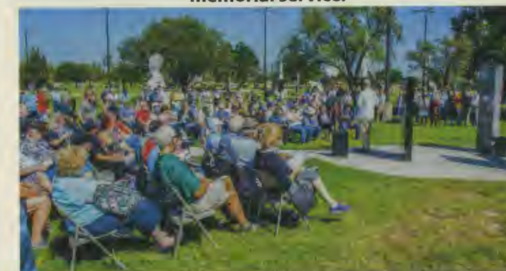
Sunny day greets ADVA members gathered for memorial service.