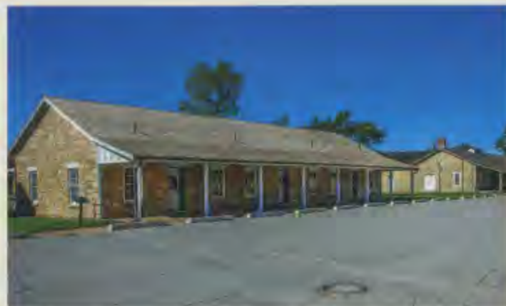
Original Army barracks at Ft. Sill.

Additional details will be in the next issue of the Americal Journal and on the americal.org website. I may be reached at lswank@aol.com .