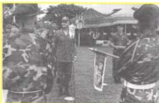
General William C. Westmoreland presents Presidential Unit Citation to the ARVN 8th Airborne, September 1967.

"The materials are of a much broader spectrum than that of just trial transcripts,"