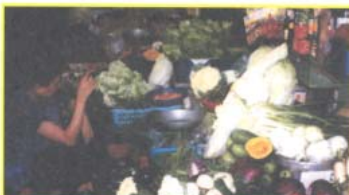
Saigon Central Market, July 1998