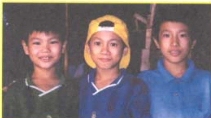
65% of Vietnam's population has been born since the war. Vietnamese children, Hanoi, July 1998.