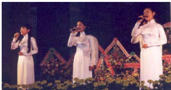
Can Tho University student singers.