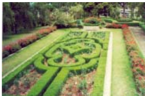
Garden of Bao Dai's Summer Palace, Da Lat.