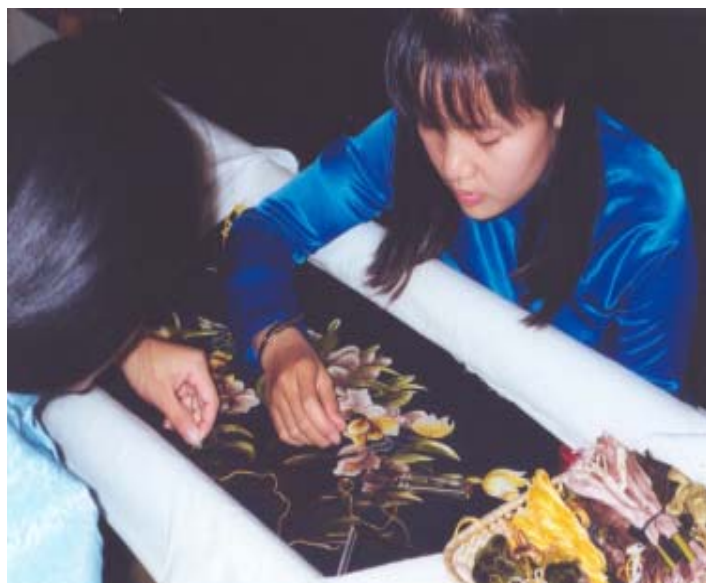
Exquisite Vietnamese needlepoint work, Saigon.