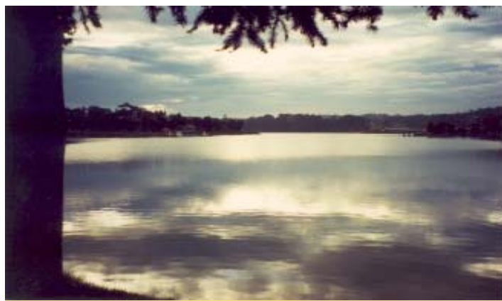
Vietnam solitude -- Ho Xuan Huong, Da Lat.