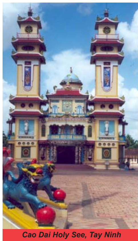
Cao Dai Holy See, Tay Ninh

J. C. Campbell Collection. Blue-jacket with hand-stitching on the back depicting a "fighting shark" of the DD 754.