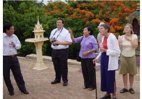
Touring a temple in Cambodia.

At a market I buy an ao dai , a traditional Vietnamese dress, and this is a real experience. The market has many stalls that sell beautiful fabric pre-cut specifically for an ao dai . Miss Binh, a lady my age who volunteered to take me shopping, suggests the selection of a beautiful fabric that I purchase. The young lady at the stall who sells us the material then leads us outside the market to the shop of a woman who will actually make my ao dai . She is very nice and she takes dozens of measurements. The garment turns out beautifully, and I love wearing it.