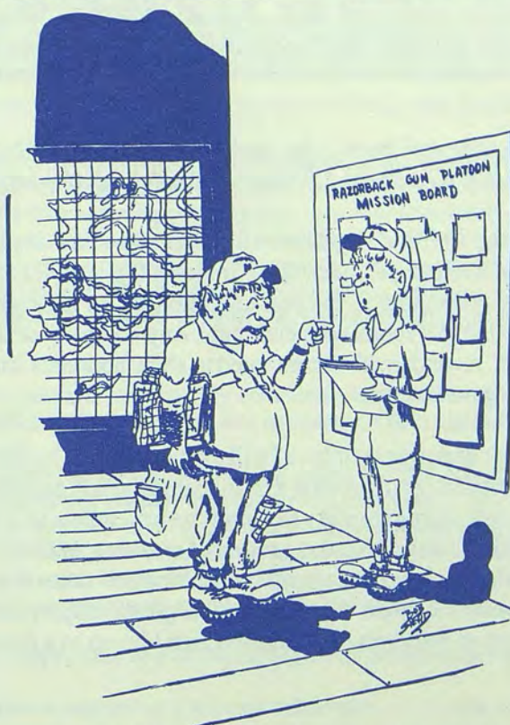
"..... Listen, Lieutenant, I can call them pigs and they can call themselves pigs, but to you damn staff-types they're razorbacks, okay?"

Yes sir-they're Razorbacks!!! I hope you "Pigs" can reuuuun with us in Reno.